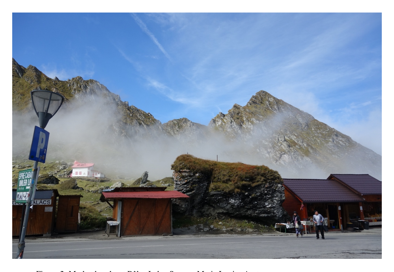
Figure 2: Market booths at Bâlea Lake.

[a protected area] is stupidity. The bureaucracy prevents you to make ski slopes. The government implemented these protected areas so that people can't develop the area. (...) Maybe it works on paper but not in real life. At Bâlea Lake a national park could be established. (...) Up there [pointed towards the mountains], Natura 2000, protected areas, they're bullshit because you can't do anything in the area. You can make protected areas, but not where there are thousands of tourists! Either/or. (Raul, tourism operator, September 27<sup>th</sup>, 2017)