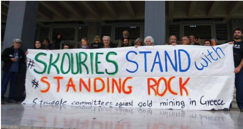
Figure 3. A banner held by Greek activists against gold mining, linking their struggle against mining to the struggle of Indigenous groups against the Dakota Access oil pipeline. On the day Barack Obama visited Athens in November 2016, the banner was placed in front of the building housing the US consulate in Thessaloniki, N. Greece.