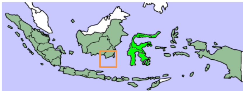
Figure 1: Study area, island of Kalimantan or Borneo, within the Indonesian archipelago. (USAID)

Some of the land in Tabanio and Ujung Batu was privatized and legally certified by local land agencies and notaries, and some was communally owned and managed. A percentage of the flat land was fallowed and overgrown by white samet ( melaleuca cajuputi ) trees, with some marsh and wild grasses, and coastal mangroves (i.e. rhizophoraceae ). Uncultivated coastal land was governed by multiple management regimes. Village elders assumed common governance through indigenous laws guaranteeing equity and sustainability, government officials assumed public governance through policies and programs for local farming and sand mining, and villagers had user rights for sustenance and livelihood.