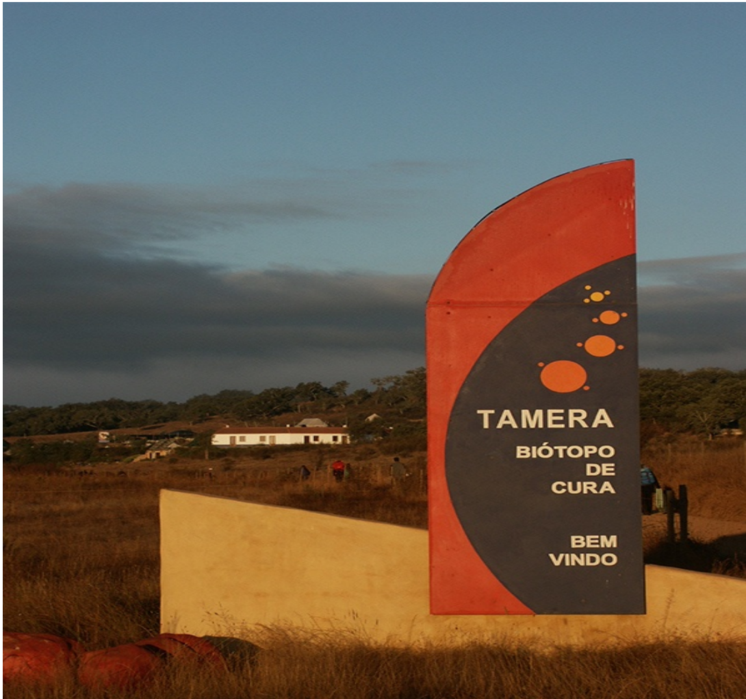
Figure 1: Tamera's main entrance.

Entering Tamera feels like crossing a materialized border between Iberia and Central Europe, with all their socio-economic, cultural and natural contrasts. The ecovillage is located in a region that is suffering a severe ecological, socioeconomic and demographic decline. The Alentejo is Portugal's biggest and most sparsely populated region, comprising only 7.2% of the total national population with a density of only 23.7 inhab./km 2 in 2010 (Alves et al. 2015: 5). During the 20th century, the municipality of Odemira was subject to a process of natural and human desertification that turned it into one of the poorest in the European Union, as well as one of the most exposed to the effects of climate change. 19 During the warm months of the year, the nearby villages of Colos (Figure 2) and Relíquias look almost deserted, except for their main squares and the odd sidewalk café, occupied by groups of elderly people, mostly men, who spend the afternoons chatting and playing cards. Sometimes they share the space with small, transient groups of Central or Northern