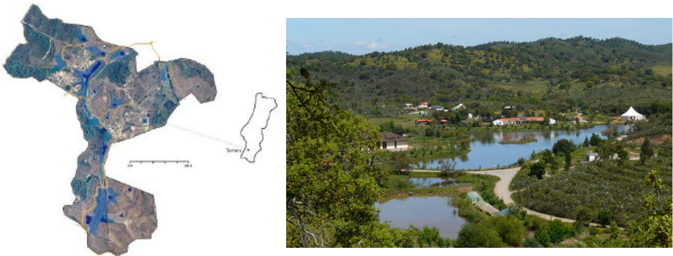
Figure 4: Views of Tamera's water retention landscape (WRL) showing lakes.

Tamera took advantage of the abundance of sunshine and rain in the region to begin the development of a commons-based economy, based on a strategy of ecosystem regeneration aimed at promoting autonomy in water, energy and food production. This strategy aims to be recognized as a replicable model for subsistence in autonomous communities, and for climate change mitigation. According to sources from Tamera's Ecology Team, the ecovillage was already producing 54% of all the electricity consumed within its premises in late 2015. This is thanks to experimental research on renewable energy-based technology that is being developed at Tamera's Test Field 1, including a Solar Village for pumping water, powering greenhouses and food processing and storage. This was envisioned by German physicist Jürgen Kleinwächter, CEO of Sunvention International GmbH. 24 The system is complemented by Scheffler mirrors,