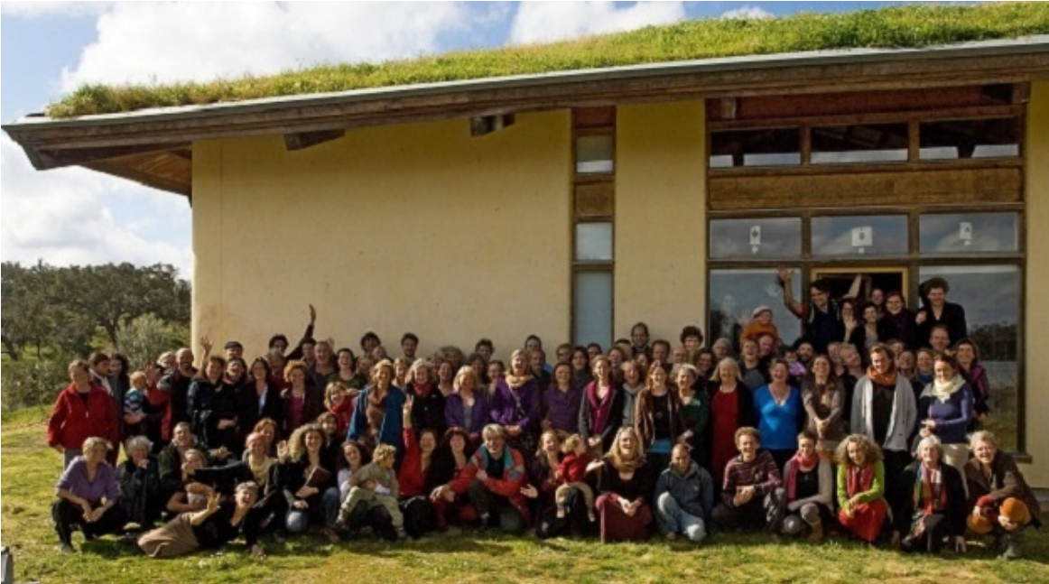
Figure 3: Group picture of the Tamera community.

The socio-economic standing of Tamera community members contrasts with the surrounding villages, but also Portugal as a whole. This is to a large extent a result of the internal economy of the community, and also because of the criteria for accessing membership, which creates selective pressures that favor people with the following characteristics: