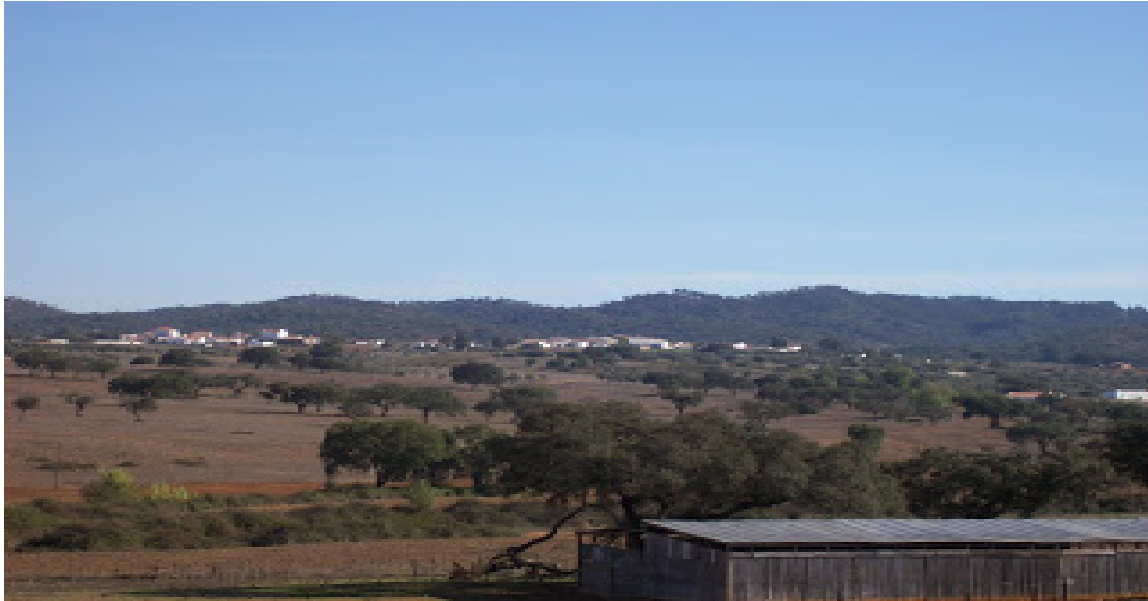
Figure 2: View of Colos from nearby Monte das Ferrarias.

European tourists and expatriates, who tend to keep to themselves and rarely mingle with the locals. These villages are located more than five kilometers away from Tamera. Their population decreased sharply between 1950 and 2011, from 3,515 to 931 inhabitants in Relíquias, and 3,045 to 1,005 in Colos. Tamera, in contrast with the homogenous, impoverished and ageing population of the surrounding villages, feels like a densely populated, youthful cosmopolitan hub, with a strong feminine presence in public spaces.