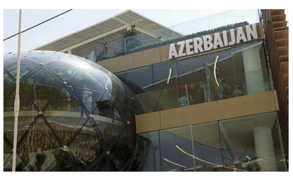
Figure 2: Tulips from Azerbaijan. Source: Wikimedia Commons. Attribution - \underline{1} , 2: author, and \underline{3} .