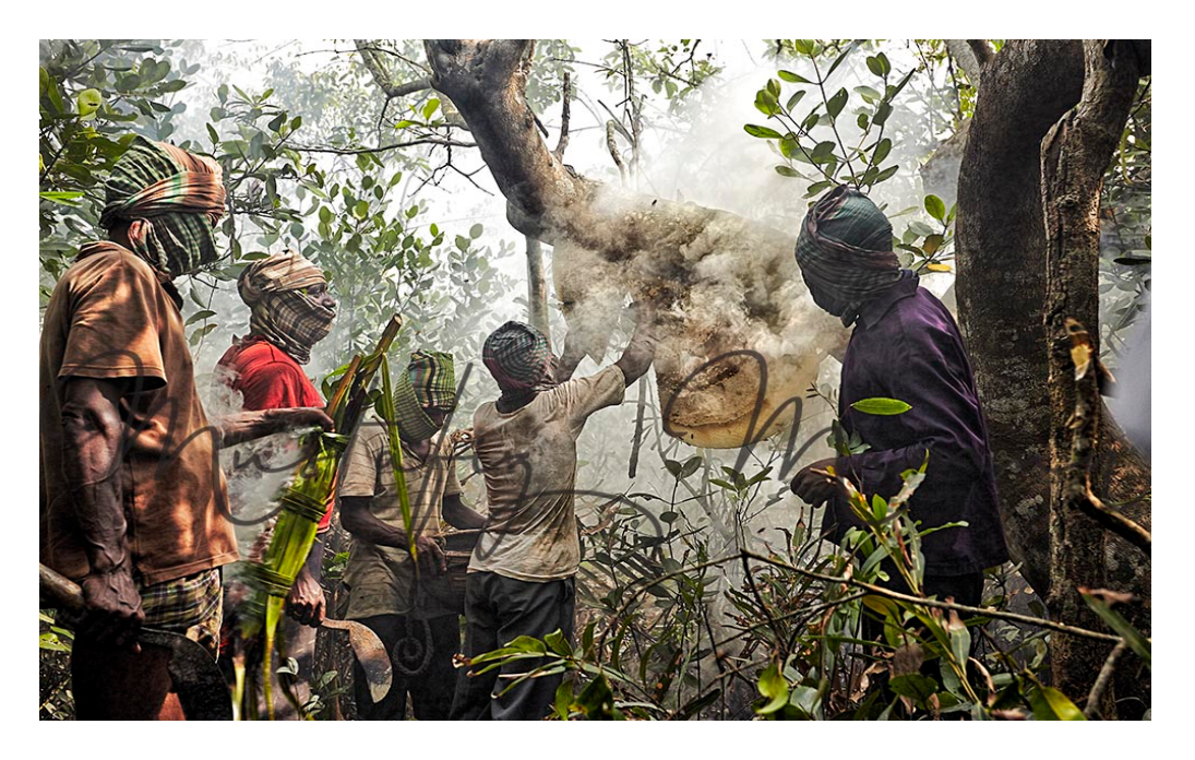
Figure 2: Wild honey collection from the forest. ^{\rm 16}