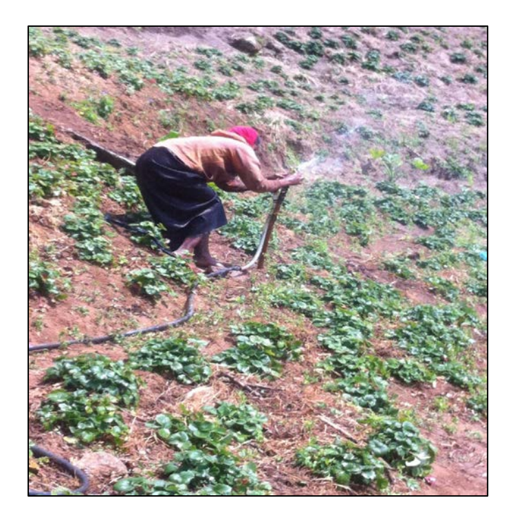
Figure 2: Hosepipe irrigation of strawberry production in Choma

the hosepipe systems.<sup>3</sup> Those who can use irrigation are in a position to increase their incomes relative to those who can only farm dry land plots. On the irrigated land, there is a high diversity of vegetable crops, including carrots, celery, onions, lettuce, Chinese cabbages, cabbages, leeks, coriander and others. Fruit crops include tomatoes, peppers, strawberries, raspberries and other berries. Passion fruit, papaya and bananas are also grown. The vegetable and fruit crops have a good market in Morogoro. Farmers often sell direct to expatriates and wealthier local families living in the Forest area of Morogoro. Fruit sellers from the mountains also sell their produce at the door of the more expensive supermarkets. Some farmers working with SAT have collective organic certification and sell their produce in a small shop in town.<sup>4</sup>