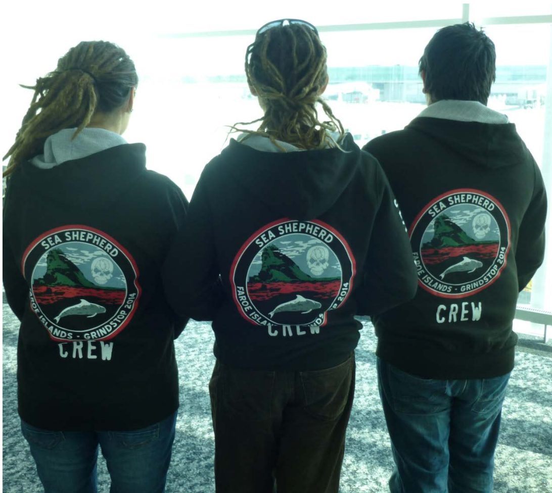
Figure 2: Three SSCS onshore crewmembers, displaying the Grindstop 2014 logo.

of people to oppose and protest against grindadráp within the bounds of Faroese law but stated they had "no basis for dialogue or cooperation with [SSCS]" (Wang 2014). SSCS activists were largely tolerated but were met with overwhelming force in the event of grindadráp : Danish military forces were stationed in the Faroes throughout the summer and large numbers of police deployed rapidly to relevant whaling beaches whenever a whale drive looked to be taking place (e.g. at an intended drive in Hvalba [Olsen 2014]) and quickly sealed off the area. During the summer, the official response was criticized for failing to actively contest SSCS' media campaign (Lindenskov 2014f) and the Faroese parliament discussed whether more action should be taken in future (Gregersen 2014).