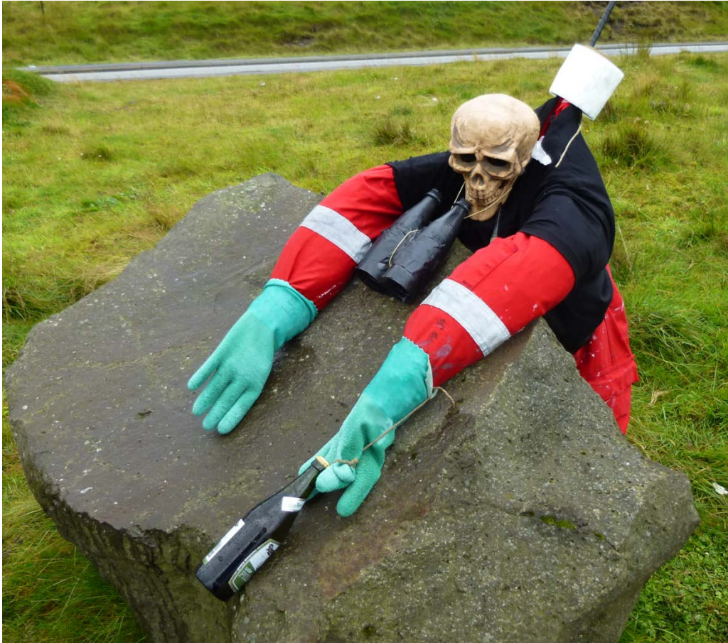
Figure 4: The SSCS 'crewmember' that appeared on the road into Tórshavn.

global goals and dialogue largely pointless. Indeed, most media appeared to be aimed more at an international rather Faroese audience. By contrast, the representations and actions of defenders of the FPW were decidedly more local. FPW orderers would painstakingly explain this for both domestic and international audiences while the actions of Faroese (and Danish) authorities decisively enacted this ordering when SSCS activists crossed the line of 'legitimate protest.'