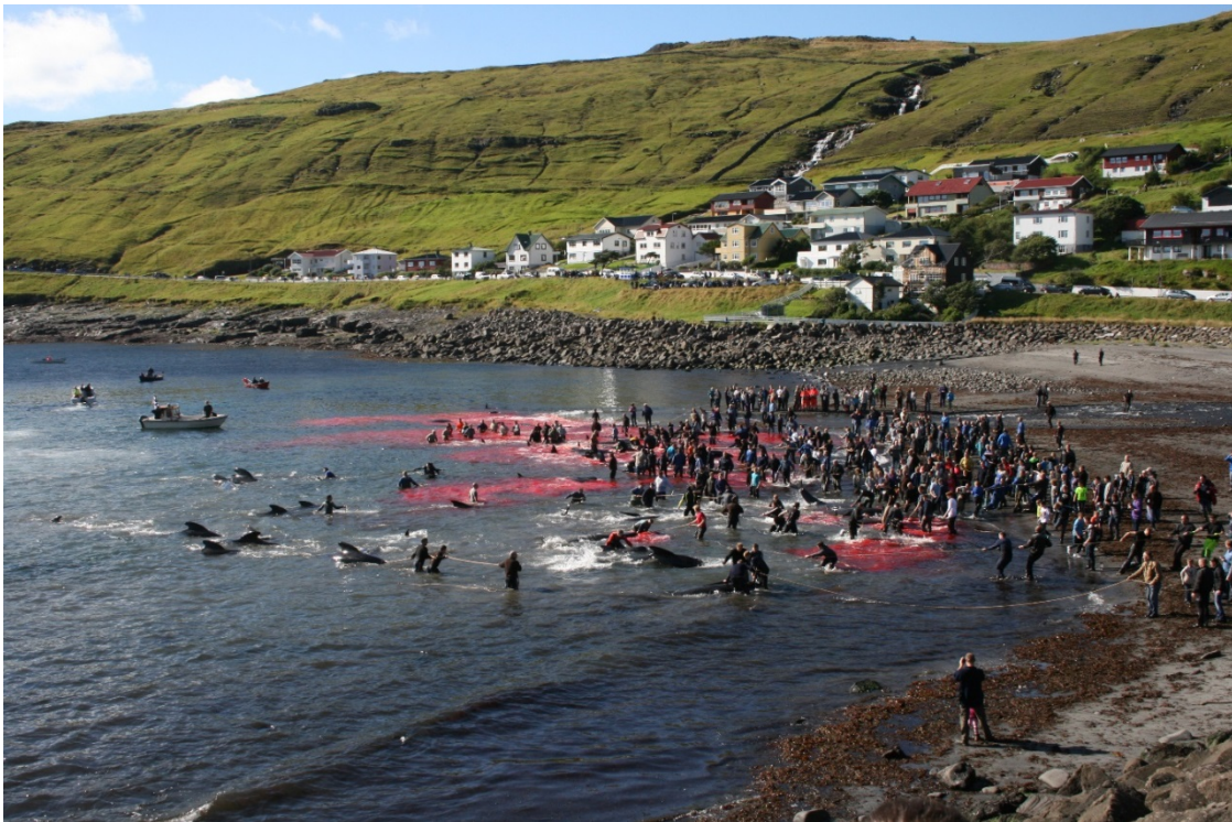
Figure 1: Grindadráp in Sandavágur in 2013.

The world at large became aware of grindadráp in the 1980s, with a number of environmental organizations beginning to protest against the practice since 1985 with sporadic campaigns occurring since (Joensen 2009). These campaigns have involved letter writing, occasional sabotage efforts and attempts to enact an economic boycott of Faroese (largely fish) products (Kerins 2010). Since the 1980s SSCS have been one of a group of organizations protesting against grindadráp . As such, SSCS have periodically campaigned in the Faroe Islands prior to Grindstop 2014, most recently in 2011, where their activities were broadcast as part of the television series Whale Wars . Partially as a reaction to the various protests, significant changes have occurred in governance of grindadráp : the PWA was formed, research was funded and continues into the population status of the pilot whale and a variety of changes to whaling equipment and methods were instituted in order to reduce the length of time required to kill a pod of pilot whales (Fielding 2010: 433). Support for grindadráp , whilst difficult to gauge precisely, remains high within the Faroese population: one random, weighted survey of 528 people (approximately 1% of the population) conducted before SSCS arrived in the islands determined 77% of those sampled felt that it was right to continue driving whales, with 12% stating it should cease (Gallup Føroyar 2014).