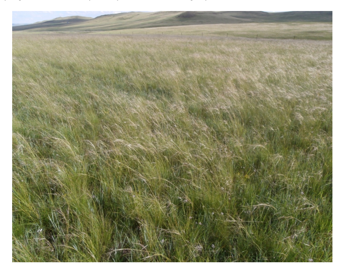
Figure 2: Fenced pastures in New Barag Right Banner. The plant species associations are dominated by <u>Stipa baicalensis</u>, a species of needle grass that both local officials and pastoralists assert is harmful to livestock and an indicator of overgrazing.

population is dominated by ethnic Barga Mongols who have traditionally populated the western areas of Hulunbuir League and the extreme eastern portion of the Republic of Mongolia. The Barga are a subgroup of the Buryat Mongols that live in northeastern Mongolia and in the Trans-Baikal region of Siberia, and speak a Buryat-Mongol dialect (Humphrey and Sneath 1996a, 1996b). However, both the village and pastoral populations include some Han Chinese whose families migrated into the region from other provinces following periods of famine and economic strife in the 1950s and 1960s (Pasternak and Salaff 1993). Before the 1990s, like other regions of Inner Mongolia, NBR pastoralists practiced mobile pastoralism characterized by seasonal nomadic migrations and collective management of grasslands. Herders typically made between four and ten annual pastoral movements, but during years of poor precipitation, harsh winters, or drought, they might have made as many as thirty movements and emergency otor .