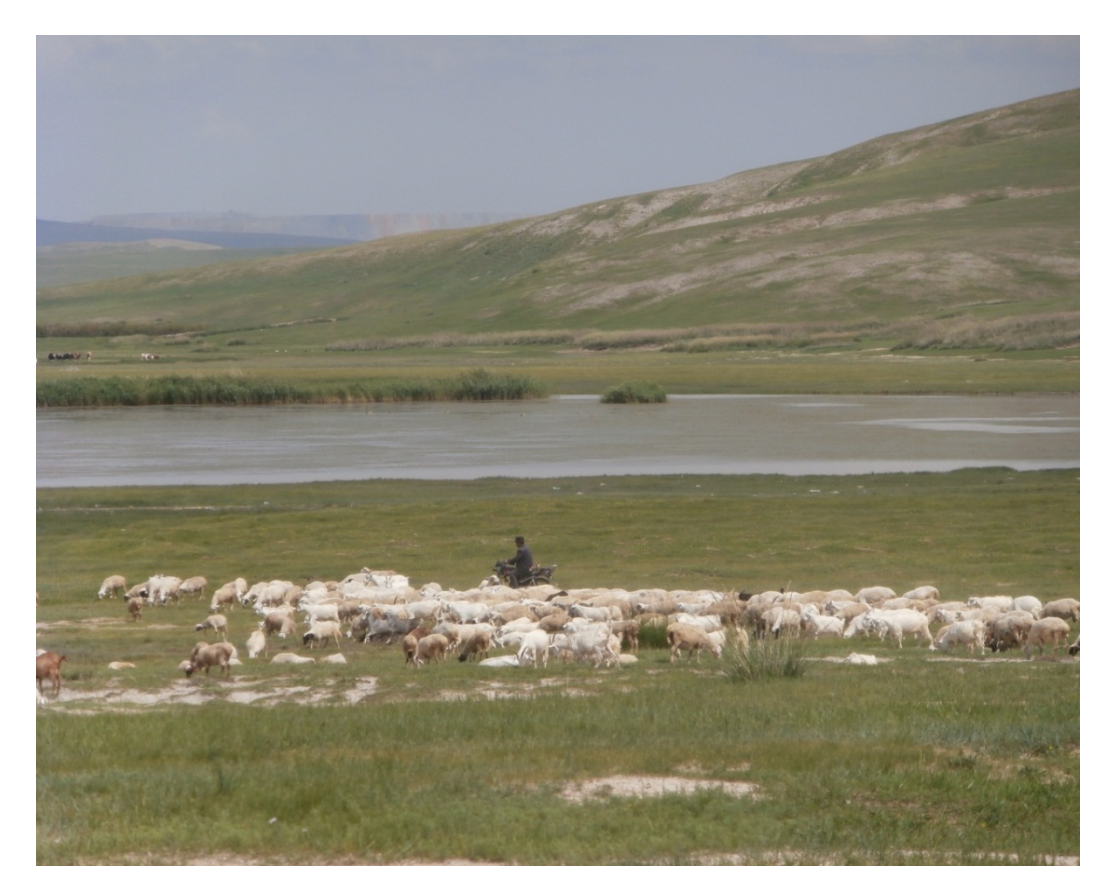
Figure 3: A Barga pastoralists herds his sheep by motorcycle.

mobility and is seeking to develop land management policies designed to work in conjunction with pastoral mobility (SDC 2010), the Chinese state continues to promote sedentarization and aims to fully sedentarize nomadic communities in the Xinjiang Uighur and Tibet Autonomous Regions (Ptackova 2011; Xinhua 2012).