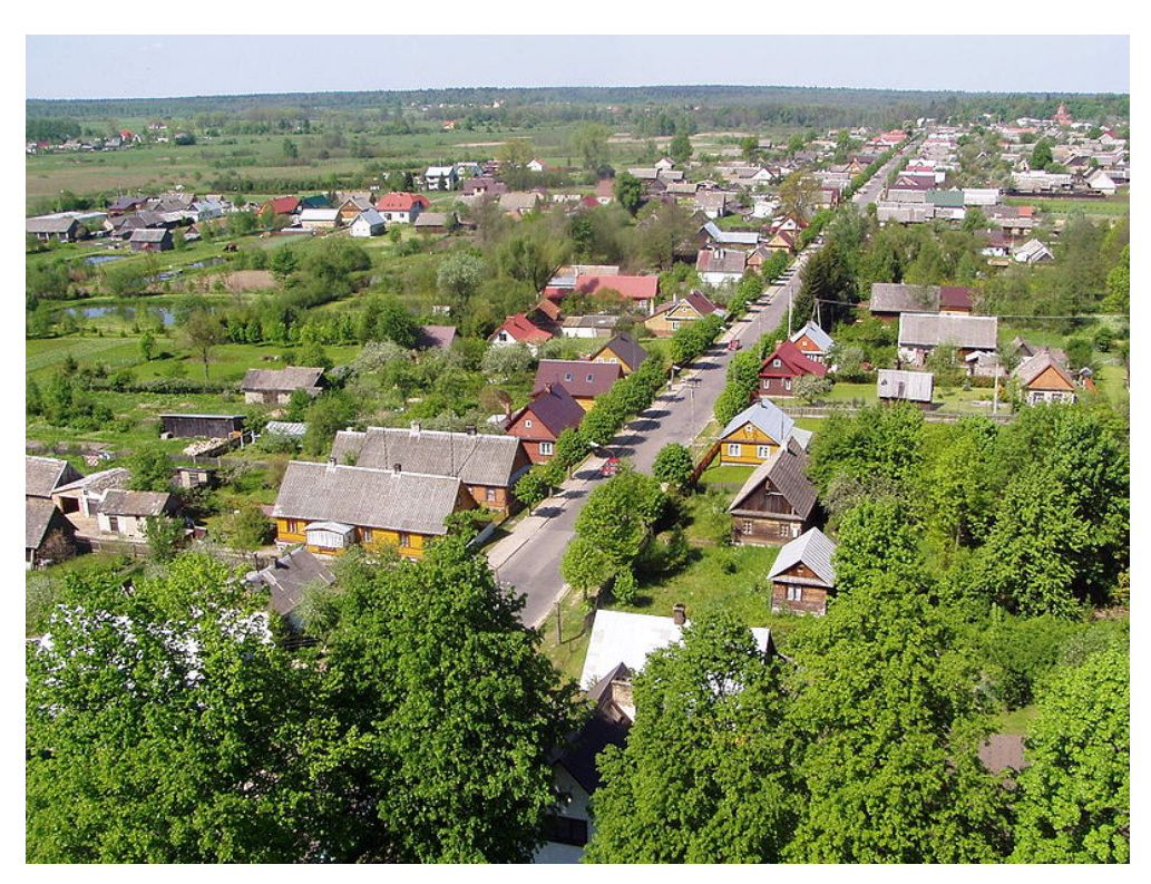
Figure 2: Białowieża village, 2005.

One manufacturer who makes ceramic bison for tourists told me; "the forester is like the auroch (the ancient progenitor of the domestic cow). He keeps the canopy open for new growth." A seasonally employed woodcutter, now working as an independent contractor, said: