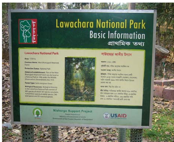
Fig. 1: Lawachhara National Park in Bangladesh (no.2) and Park signboard.