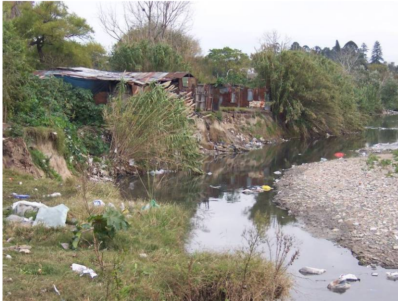
Fig. 3: Squatter settlement along Miguelete River, Montevideo

Montevideo's environmental problems are evident to anyone who lives or ventures beyond the central and eastern sections of the city. The Pantanoso River borders the northwestern edge of La Teja and together with the Miguelete River to the east, provides La Teja with a spatial embrace of industrial and domestic waste and water-borne illnesses. A human geography of squatter settlements follows the banks of these rivers, susceptible to flooding and the multiple poisons carried by the rivers (Figure 3). Leather tanneries along the Pantanoso shores dump untreated wastewater into the river accumulating 160 metric tonnes (176 US tons) of Chromium per year (P. Muniz et. al. 2004: 1022). Both the Pantanoso and the Miguelete flow into Montevideo Bay, leading to waters highly polluted with lead, chromium, mercury, copper and other heavy metals (P. Muniz et. al. 2004: 1023).