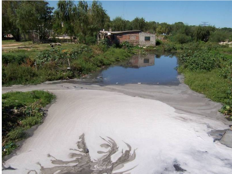
Fig. 4: Industrial waste flows into La Teja waterway

of widespread lead pipe connections, OSE maintained from 1982-2007 a water quality standard permitting 50 \mu g/L of lead, or five times the World Health Organization's recommended limit. 4