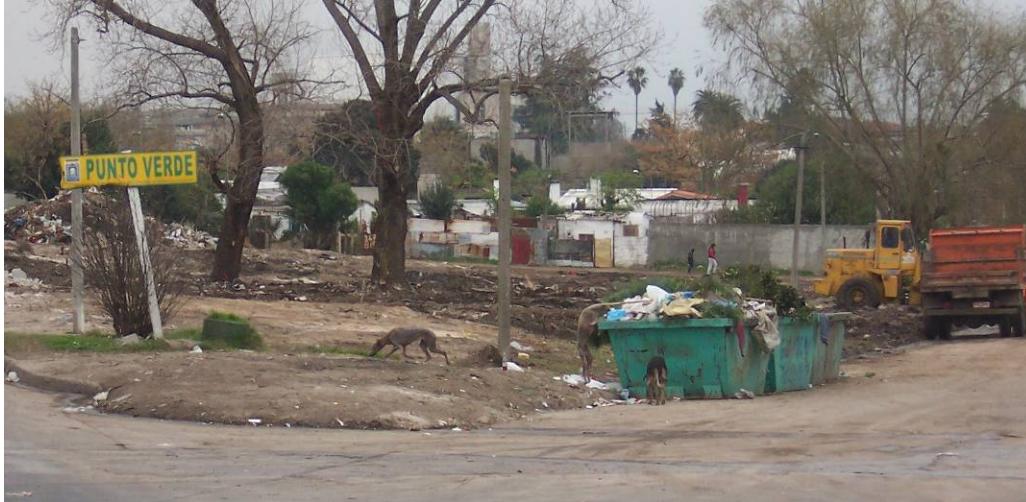
Fig. 5. Area of high lead contamination, former squatter settlement site, La Teja

Neoliberal restructuring and socio-economic decline in Uruguay, then, resulted in both new and intensified exposure rates of lead for the general population, with children, pregnant women and the "new poor" facing differential levels of risk and vulnerability. The decline in quality of health care and services to low-income families increased risk for vulnerable subpopulations for which poverty and malnutrition conditioned and limited their ability to mitigate the impacts of toxic exposure. 5