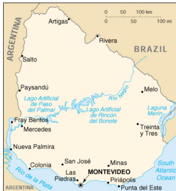
Fig. 1: Uruguay map

Traveling through Uruguay's countryside, one discovers a bucolic landscape of rolling green hills dotted with clumps of trees, intermittent streams and ever-present cattle, sheep and birds. The nature of Uruguay, the Guaraní name meaning "river of the country of birds" (A. Trigo 1990: 9) does not conform to the dominant western romantic tropes of "third world" nature. There are few forests and vegetation is thin, there are no "forest peoples" or indigenous populations, and there is a general absence of large wild animals, the "charismatic megafauna" (N. Smith 1996) that have become some of the developing world's most iconic symbols. Uruguay's 3.2 million people are over 90% urban based, with well over half of the country's population settled in the Montevideo metropolitan area (Figure 1). The rest are mostly concentrated in cities and villages of the interior, leaving vast expanses of pasturelands throughout most of the territory's 176,215 km 2 (68,000 miles 2 ), in which the occasional modern day gaucho on horseback often symbolizes the lone human presence.