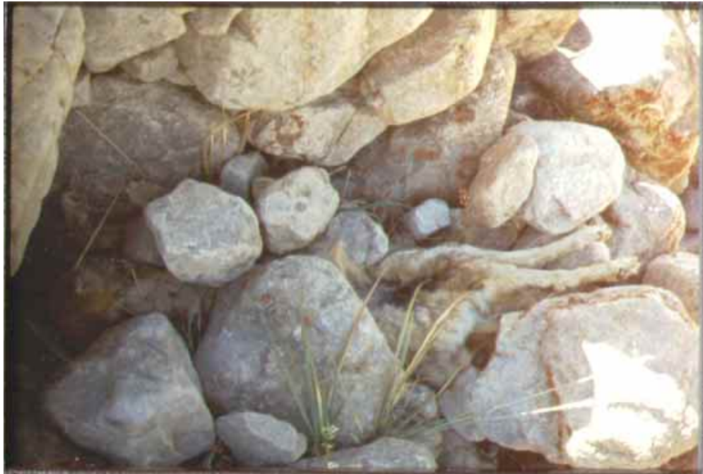
Figure 2. Wolf killed in stone trap.

Despite the fact that the agreement relaxes the “no-grazing” clause and allows “traditional concessions of grazing” under certain conditions (Table 2), the Shimshalis remained sceptical of any interference with their customary herd management. They feared that this was only a first step towards ending the grazing of domestic animals inside the KNP. Unlike the seven Wakhi villages along the KKH, the Shimshalis did not graze animals on the Khunjerab plateau, nor were they willing to trade their customary grazing rights for monetary compensation. For them, economic compensation had never been an issue. It is, therefore, all the more surprising that the other Wakhi villages signed because the agreement does not refer to the compensation issue. One reason why the other Wakhi villagers signed could be the implied use of force. In order to make the Shimshal villagers sign the agreement, in 1991 the government dispatched the district Commissioner to the village. Arriving by helicopter he threatened to imprison the spokesman of the Shimshal