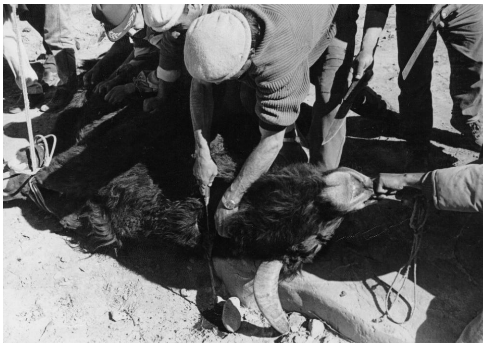
FIGURE 3. Journey's end: Male yak being slaughtered in Shimshal.

Instead of acknowledging the significance of this community, enforcement of the park plans would put an end to their pastoral animal husbandry. The plan to sedentarize the Shimshalis overlooked the cultural significance of their mountain pastures (pameer) and the biannual migration (kooch) to and from the pastures which are high points in Shimshalis' pastoral cycle (A.Knudsen 1992:46). The original park plans would fragment this local management system and upset pastoral migrations which were fully compatible with the aims of conservation. Already in 1979 the IUCN's guidelines for conservation in mountain environments pointed out that: