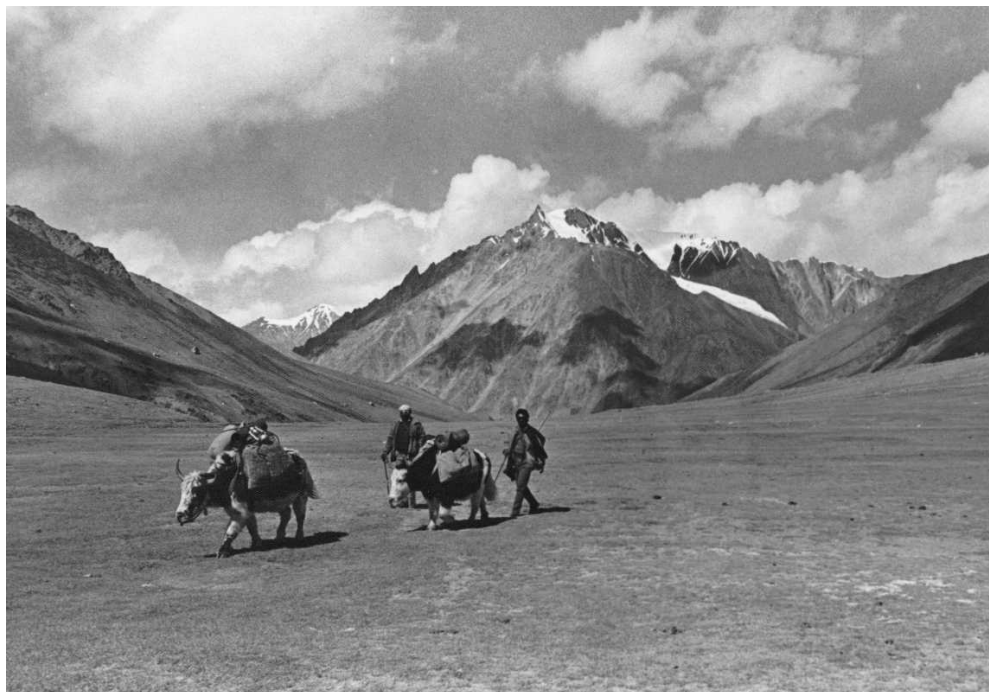
FIGURE 4. A vanishing sight? Yaks cross the Pameer pastures.