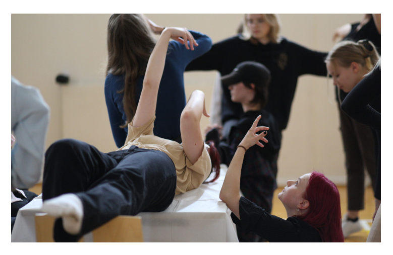
Figure 4. Day 1 of the Workshops: Dance Sequence With Tables, Chairs and Tablecloths

For the second day's work, the students were divided into smaller groups to go through the station circuit. Each station was rotated every 20 to 30 minutes, with separate gyms for Foster and Peña to conduct movement and contact exercises. Foster asked the young people to express norms and expectations they personally encounter about food