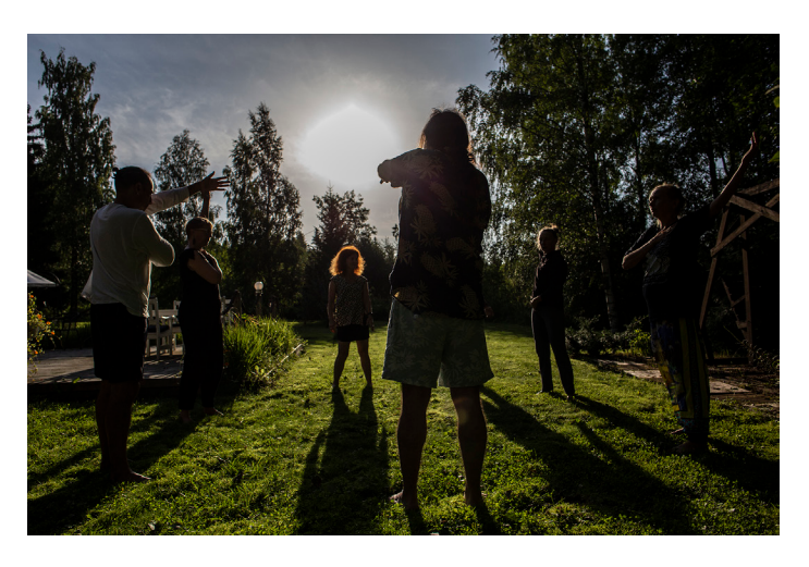
Figure 1. Morning Joint Exercise, Which Is Voluntary for All ISEAS Participants

environmental issues and themes of equality within 17 communities, involving several hundred individuals. The significance of ISEAS extends beyond its international nature and cross-cultural exchange of ideas; an immersive and intensive mode of operation characterises the symposium. Previous studies have highlighted the fruitful synergy between art and science, which has the potential to inspire novel modes of thinking (Juhola, 2018, 2019, 2020a, 2020b, 2021; Juhola & Moldovan, 2020; Juhola et al., 2020; Juhola et al., 2022; Raatikainen et al., 2020). Participation in ISEAS offers a comprehensive experience that fosters the emergence of shared understanding. Through modest communal living, participating artists, food professionals, and food researchers share time and space with other ISEAS artists and scientists, creating opportunities for dinner table conversations that facilitate the exchange of ideas and perspectives. The symposium provides diverse activities encouraging social interaction, including sauna baths, nature walks, joint conversations, yoga mornings and late-night dancing (Figures 1 and 2).