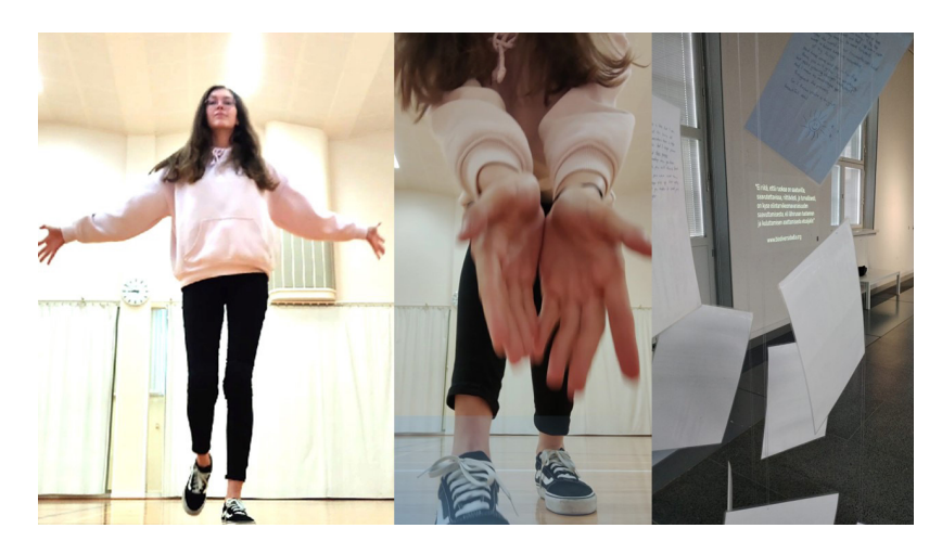
Figure 6. ISEAS Exhibition at the Lapua Art Museum, Our Shared Food. The Picture Includes Peña's Two Artworks: Video Installation Empatia and My Commitments (Images: Hugo Peña, 2022)