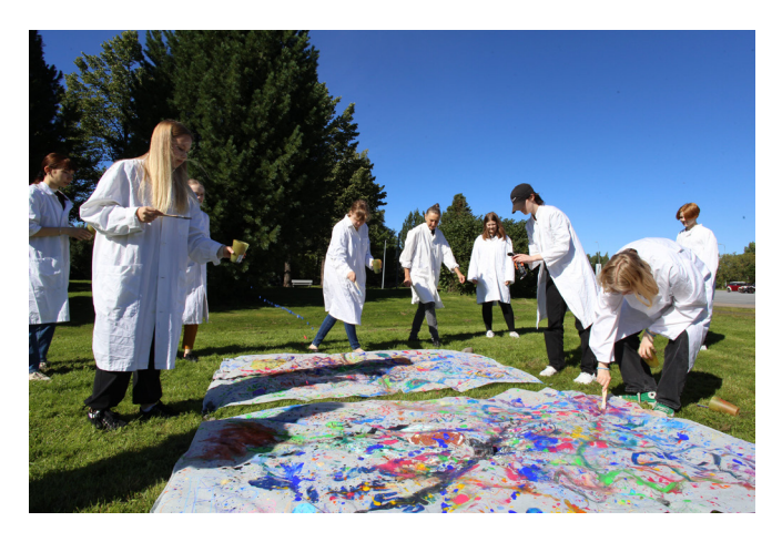
Figure 8. Students Involved in Chaos Painting ( Image: Fabio Cito , 2022)

The final ISEAS workshop featured filmed performances, a highlight integrated into the Our Shared Food exhibition at the Lapua Art Museum. One performance involved an inclusion/exclusion game symbolising social inequality, where participants formed a circle, leaving a few outside. Filmed from above with a drone (Figure 9), it provided a unique perspective. The workshop concluded with all participants forming a circle, observing silence, and expressing their emotions in one word, adding a reflective and poignant conclusion to the event.