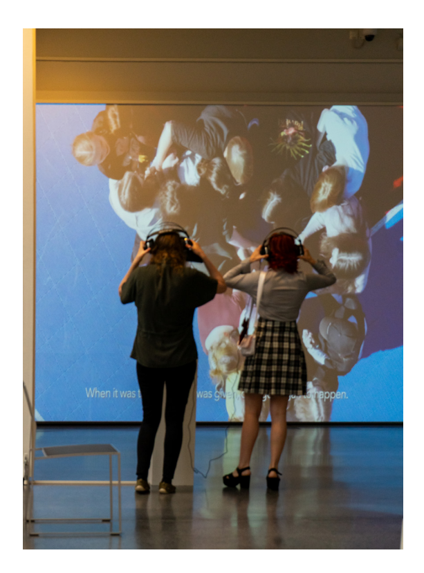
Figure 10. From the Our Shared Food Exhibition at the Lapua Art Museum, Two Students From Seinäjoki Secondary School Participated in the Opening and the Panel Discussion for the Finlandia Fair Food Games Video Artwork. Foster Subsequently Recorded a Sports Commentary-Like Narrative About Global Competition Related to Food Justice