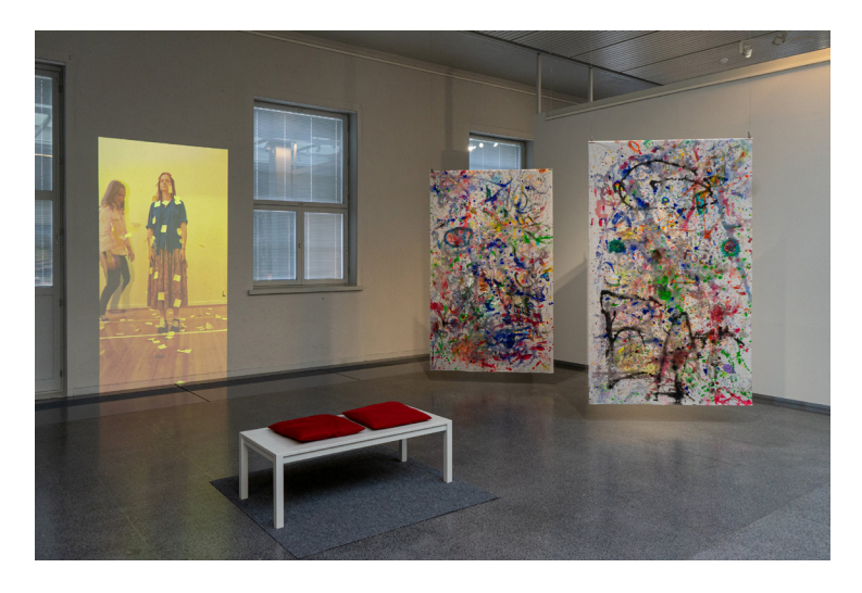
Figure 5. ISEAS Exhibition at the Lapua Art Museum, Our Shared Food. The Image Includes Foster's Video Installation Because We Are Told To and Zdanski's I Am What I Eat – Chaos of Emotions

on Post-it notes, revealing demands and expectations arising from family values, social, political, identity, health, and appearance-related concerns.