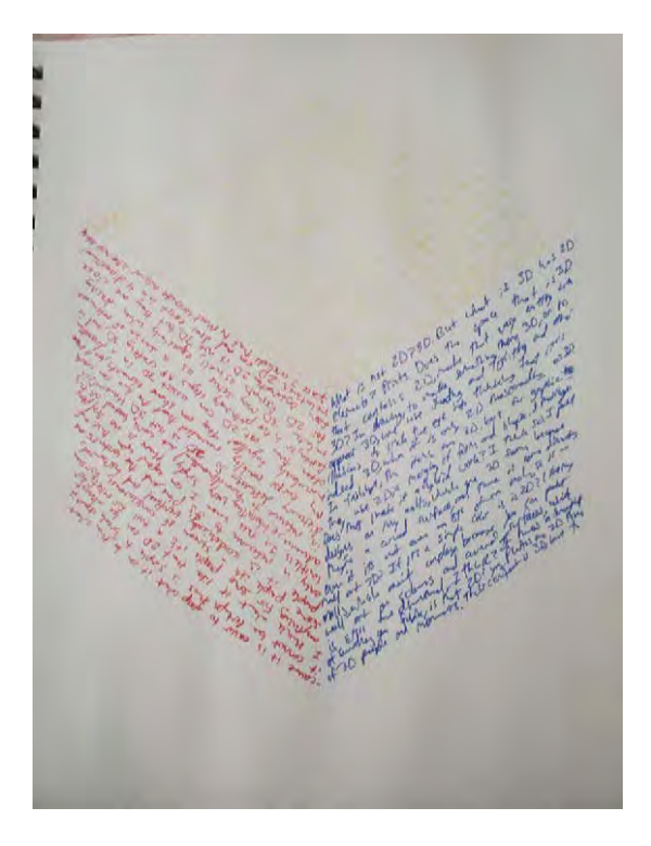
Figure 1: Lilly's "What is 2D" sketchbook work

vided a rich substrate for accumulating drawing experiments and art as research, research about art, reevaluations of artist and educator identities, and reconsiderations of how 2D art making has been taught.