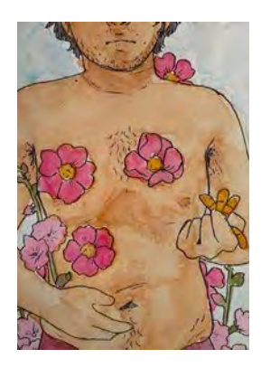
Figure 4: Rae's Triptych for Theme 2

Students and instructor were able to view documentation of the works on a shared electronic drive prior to critique and all participants were asked to identify strengths and areas for improvement prior to meeting. Students reported this approach to the critique process increased overall engagement in the discussion of artworks, as well as increased interest in accepting suggestions or applying advice to subsequent projects compared with traditional studio critiques. Secondarily, several students reported realizing critiques can be valuable formative processes rather than anxiety-producing summative evaluations. As one student noted, "I've been able to give classmates feedback that they're able to apply it to edits. I'm giving my peers a lot to read and go off on, and they do the same for me." This was a significant realization for students as they began the third theme of the course.