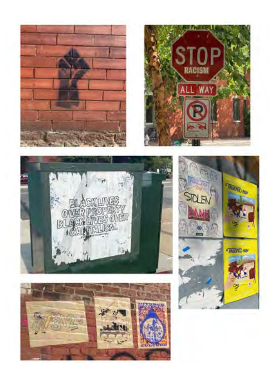
Figure 3: Ren's photo collage from "Word on the Street"

The next week, we met outside our building to escape the confinement of pandemic anxiety and to deepen connections with the rich visual and material cultures of campus. I asked students to work individually or in groups to explore the nearby built environment, taking digital photographs to document any vernacular or street art such as graffiti, wheatpastes, stickers, or other works students felt were curricular in nature for their second Look Book titled "Word on the Street." We reconvened after two hours to share.