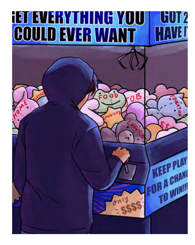
Figure 5: Rae's digital work entitled "Everything You Could Ever Want"

This student-led assignment successfully energized participation and increased work completion; final works reflected connections to prior art research, preparation sketching, and the robust feedback session. The final works did not reflect themes or media I would have prescribed for the project, and as a result, I learned more about my students' thinking about themes and media. The collective energy that resulted from our shared learning in this project helped propel us into the fourth and final course theme.