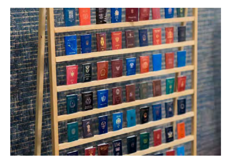
Figure 3: The Story of a Stranger (detail), 27" x 24" x 19.5", 2018, Bonam Kim.