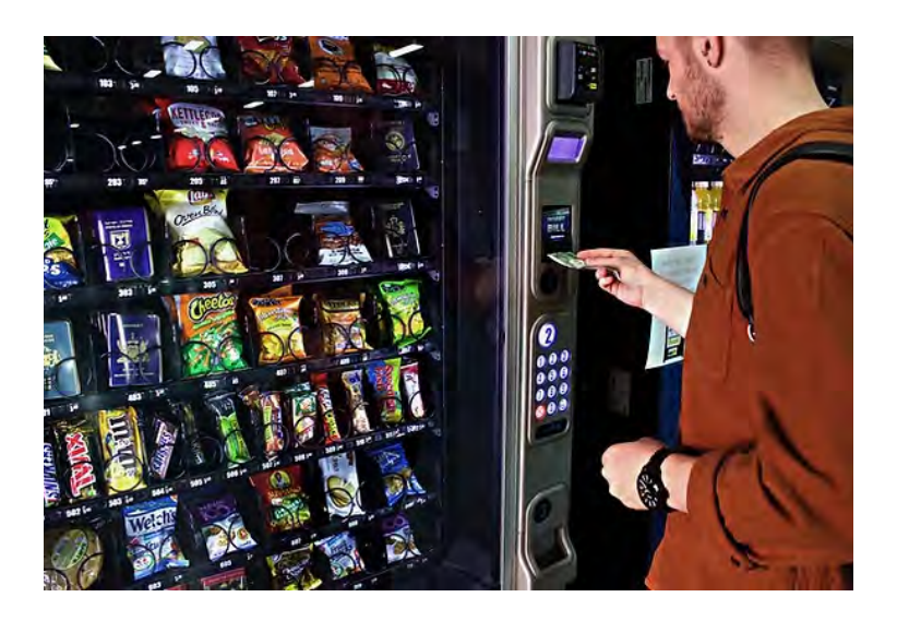
Figure 10: World's Passports, Silkscreen on paper, Vending machine, Each 4" x 5" size of passport, 2016, Bonam Kim.

When participants think of culture and their cultural surroundings while adapting to new surroundings, their thoughts about their role in society may be reflected within their own art. The participants were not only in the process of transitioning their art, but they also needed to transition out of and relearn who they were as artists in a new country. Finding a balance between preserving their cultural identity and implementing a new culture is a process that needs support, as it can become challenging for an individual to go through the process of re-evaluation alone (Alba, 1990; Kim, 2007; Phinney et al., 2001; Yinger, 1986).