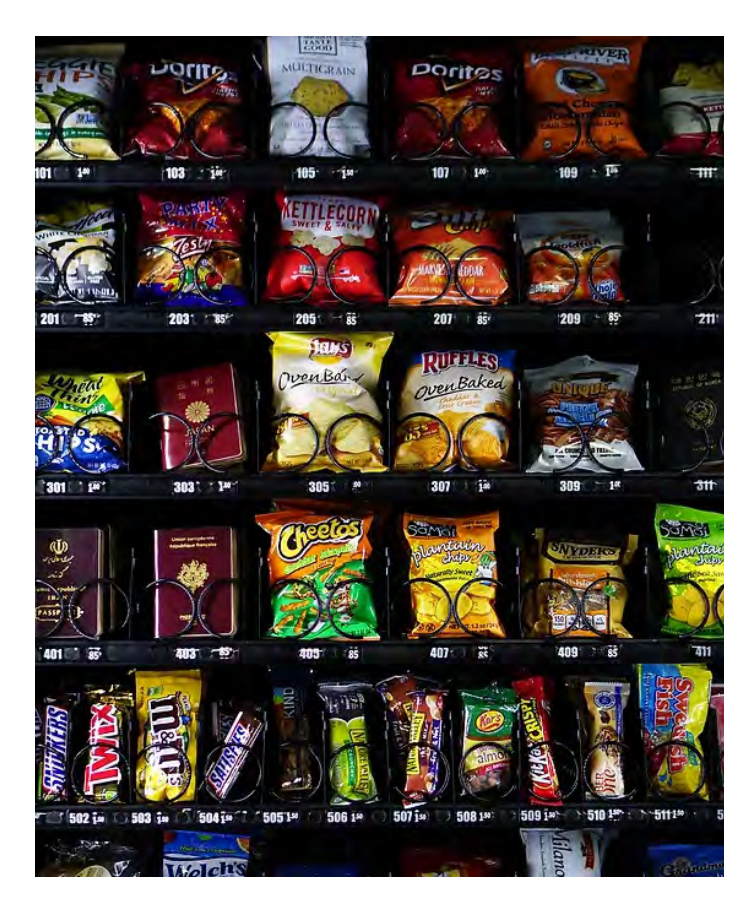
Figure 4: World's Passports<sup>2</sup>, Silkscreen on paper, Vending machine, Each 4" x 5" size of passport, 2016, Bonam Kim.