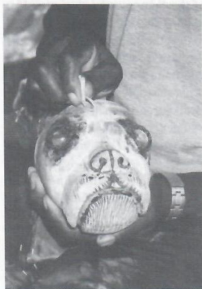
Figure 4. FACE's students learn patience by watching Samuels carve works in progress.

FACE's students have gained positive experience about art and the environment while working with Samuels. Dewey (1934) wrote experience transforms people and exposes individuals to things that were previously foreign to them. Working alongside Samuels, children learn from his example of (1) paying more attention to the environment, (2) becoming more patient, (3) using art to soothe the soul, and (4) developing positive relationships.