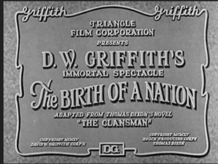
Figure 2. Cultural analysis, The Birth of a Nation

Signification: the film is an indication of the differing opinions/perspectives based on which side of the biased story one found themselves on.