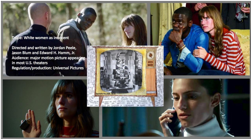
Figure 4. Innocence. Images courtesy of G.J. Wilson and VCU student, Danielle Houdek, 2018.

The White savior female protagonist in movies like Dangerous Minds and Freedom Writers , more accurately reflects the demographics of the teaching profession (U.S. Department of Education, 2016). Here, the potential for danger exists in these enduring cyclical tropes of “White = goodness = White” and less a critique of a deficit-based mindset, which undercuts the goodness already present in the minoritized student (Perry, Steele, & Hilliard, 2003; Valencia, 2010). If both of these cultural texts (films and education) are put through the circuit of culture, it is easier to see the underpinnings of a broader and historic narrative of White supremacy.