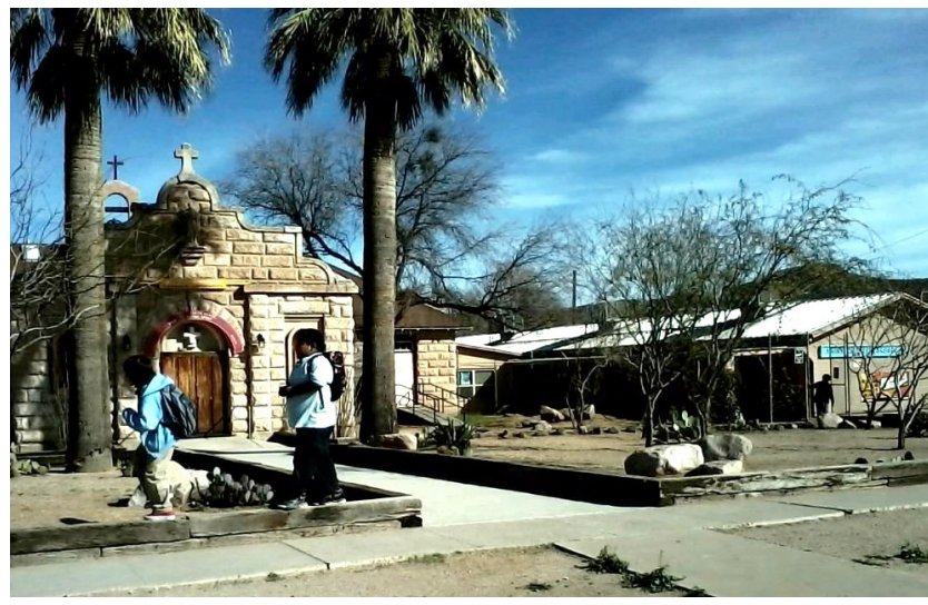
Fig.~1 St. Charles Catholic Church is on the left and gray Mission Un-School is to the right and mountains, hidden here, are in the back. like

To the right side of St. Charles Catholic Church was the St. Charles Apache Mission School, a small brick building with a low hanging roof (see Figure 1).