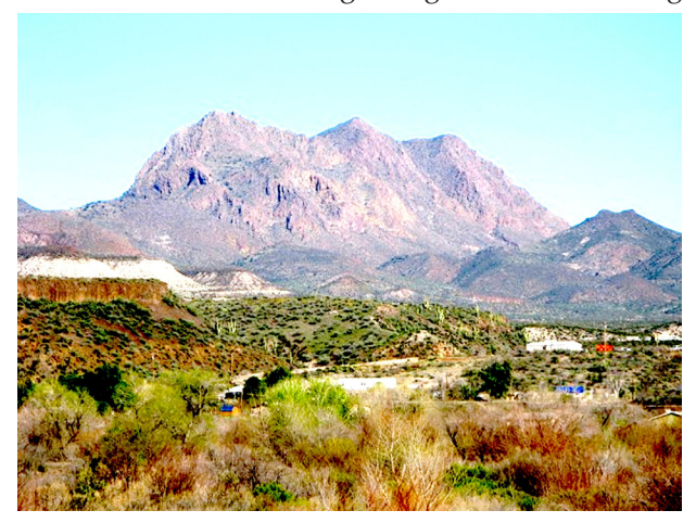
Fig. 3 The Triplet Mountain on the San Carlos Reservation in Peridot, Arizona.

Half of the drawings depicted mountains. Children started with triangle shapes for mountains. Several children called them the Triplet Mountains that are sacred and served as a lookout to see if the U.S. Calvary was coming during earlier times (see Figure 3). The mountains attract thunderstorms in the summer during the monsoon season. One student's drawing featured a dark colored sky with strokes in different directions and a brown colored mountain with a lightning bolt topping it. She called the drawing Thunder Mountain . Even though the drawing was too dark to duplicate, it communicated the wild wind and brilliant lightning that occurs during the late summer.