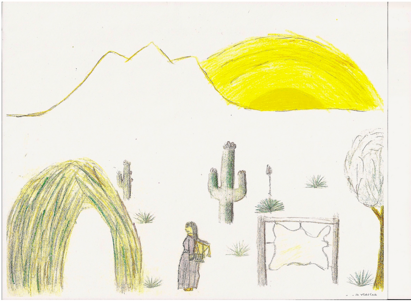
Fig. 4 A young girl, Nalin, drew the three-peaked Triplet Mountain in the background with a sunrise. In the foreground, from left to right, she depicted a wickiup (a traditional Apache shelter), a maiden carrying her burden basket on her back, a frame to support drying buckskin that she will make into a dress, and a tree as well as various desert plants in the background..

Nalin,<sup>5</sup> a young girl, drew the three-peaked Triplet Mountain in the background with a sunrise. Behind her are two blooming saguaro cacti and several yucca plants that supply reeds to make the San Carlos Apaches' famous burden basket. The tiny metal bells featured at the end of its strings symbolize rain (see Figure 4). She called her picture Big Mountain, and It Is Good , explaining that the mountain spirits protect her people.