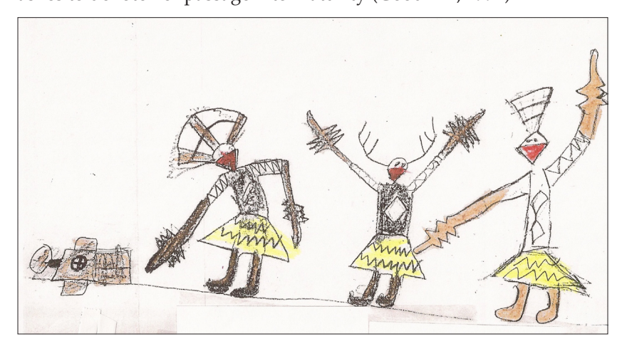
Fig. 6 Tarak drew three ceremonial crowned figures. Known as the Ga'an or mountain spirits, they dance with wands around a spectacular bonfire to provide strength and protection for the maiden.

A young male student, Tarak, mentioned that during the ceremony male dancers, called Ga'an , appear to bless and protect the young girl and to ward off illness and evil (San Carlos Apache Cultural Center, 2015). See Figure 6. The Ga'an represent the four sacred directions and colors. In Figure 6, the crowned figures wear the east color of yellow. They also wear large fan-shaped wooden headdresses painted with sacred symbols. They paint their bodies in black and white images that evoke lightning, mountain designs, and animal motifs that represent the mountain spirits. The children drew a few clan markings, such as the sun, eagle, and bear claws. On the Ga'ans' arms are tied parts of forest greens. The male dancers also dance early Sunday morning under and around the young maiden's willow frame that symbolically provides her stability. The fifth spirit is "the gray one or clown" who represents "the unpredictable." The Ga'an provide balance to a young maiden's world. During the final stage of the ceremony, the godfather paints the young girl's face with earth colors and she becomes "White Painted Lady" (Reid & Henle, 2012). The Ga'an escort her in a procession as she journeys around the earth. All participants gather around the bonfire's wood ashes and the young girl's problems are symbolically thrown on the ashes. She runs around the ashes to denote her passage into maturity (Goodwin, 1994).