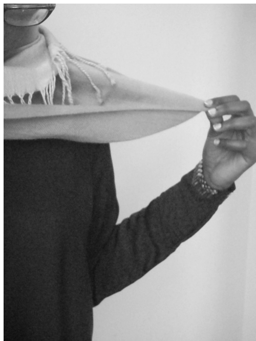
Fig. 2 Muna (2013). Used with permission of the participants

There was a time when I had to go downtown to one of the government buildings to do something with my taxes.