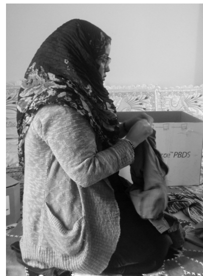
Fig. 10 Qorsho (2013). Used with permission of the participants

I talk to women who don't cover and they definitely understand why I wear it. They agree with me that we have become a visual