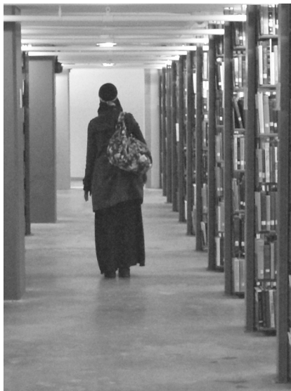
Fig. 12 S. (2013). Used with permission of the participants

The stories and images of DSVU work to agitate the public space of central Ohio, which many veiled and unveiled Somali women inhabit. While the exhibit's explicit goals are to interrupt the misperceptions of the Somali community held by non-Somalis, there are also implicit goals to represent Somali culture and identity as fluid by exploring multiple perspectives across different segments of the community. Agitating public space entails challenging the single stereotypes through claiming and retelling stories of lived experiences. The DSVU exhibition does this