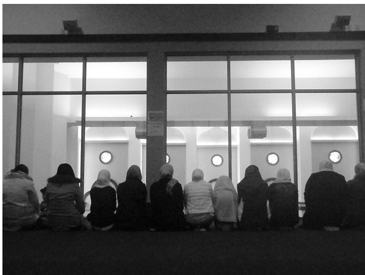
Fig. 8 S. (2013). Used with permission of the participants

ways it seems that they are changing the perception of Somali women as if they were oppressed and now they're liberated because they don't wear the same clothes. Now I realize it's more of a personal choice – it's really up to the individual how they want to dress, and how they want to express themselves. And if those women choose to not wear the hijab it's really between them and God. I realize I shouldn't be so judgmental. It's easy to be judgmental; I know that. I still don't agree to it – I believe that what makes us Somali is our commitment to our faith and we go against the norm in many ways and it's a marker of strength because we're able to do so much in such a strong way; it's almost that we're showing American society that we're not going to change. We'll do some things - we'll learn English, we'll adhere by the laws of America, but we are going to choose to wear what we wear because it's important to us. (Qorsho)