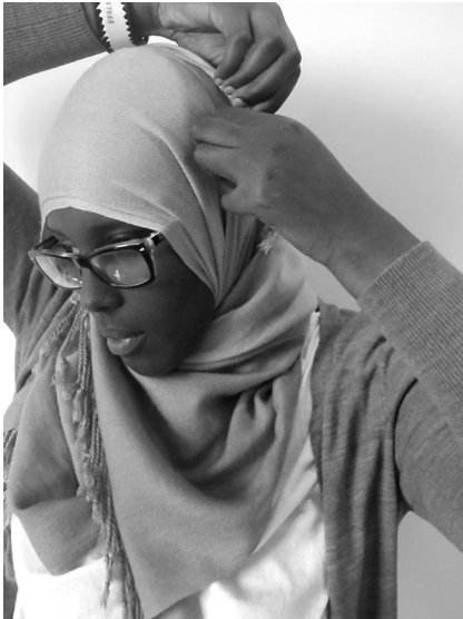
Fig. 11 Muna (2013). Used with permission of the participants

carry yourself. I also have friends who are Muslim and don't cover. We have conversations about hijab . For some Muslim