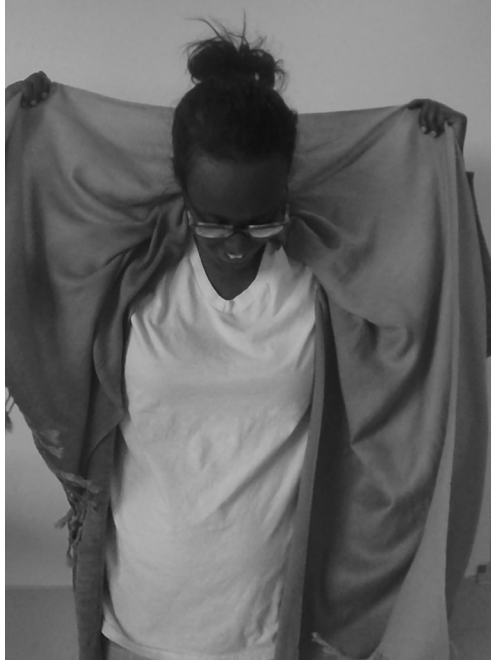
Fig. 4 Muna (2013). Used with permission of participants.

She uplifted me a little, and I thought, “It’s time to grow up.” So I put it on. I saw that friend switching back to her old ways and for me to see that she was even becoming worse. I thought maybe I just did it in the heat of the moment. I’ve realized since then that I wasn’t ready and just jumped into it. In the Islamic religion, we call that having