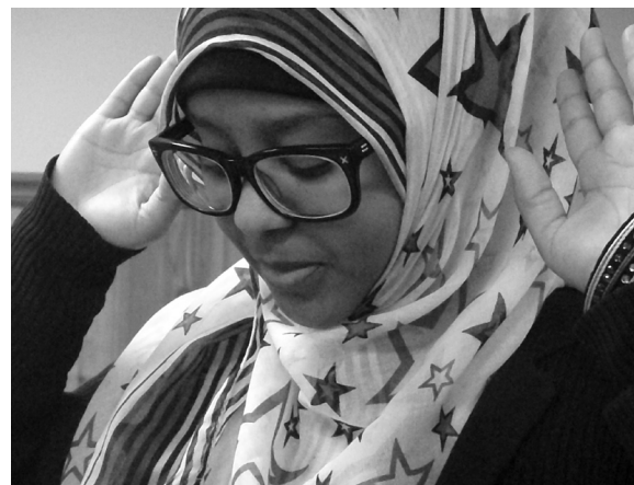
Fig. 4 Hoda (2013). Used with permission of the participants

from the heart and not just because I'm supposed to do it. There was a point in my life where I thought I was ready and wore it for a year straight. I still wore jeans and stuff, but I tried to cover my hair. One of my really