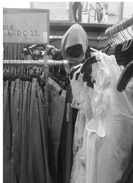
Fig. 3 Muna (2013). Used with permission of the participants

treatment” and allow me to use a private room. I wear my hijab every day, but because I was wearing my work uniform, khakis, and a sweatshirt, I was told I was not Muslim by someone who