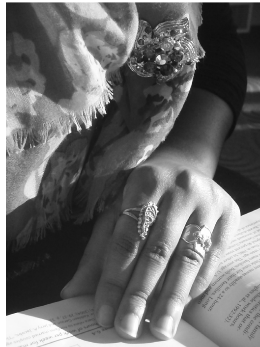
Fig. 7 Nasra (2013). Used with permission of the participants

lot of negative assumptions are made when we’re looked at and to me it’s completely the opposite. To us, our dress means so much more. It’s not about covering us up and hiding our jewels. It’s more about our devotion to God. Initially, I perceive Somali women who do not cover negatively because it seems like they are Westernizing our values and our customs. It’s weird because I