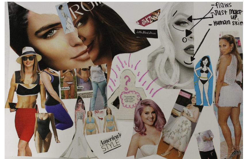
Fig. 1 Collage. Image used with artist's permission.

America's style [split woman, black and white] Skinny [a woman is pieced together] Little Black Dress [little white wedding dress] Flaws. [drawn on] Just make-up. [painted on] Human skin. [looking back] [white dress, white dress, white dress] Put yourself in this picture often enough and it just might happen. [question mark?]