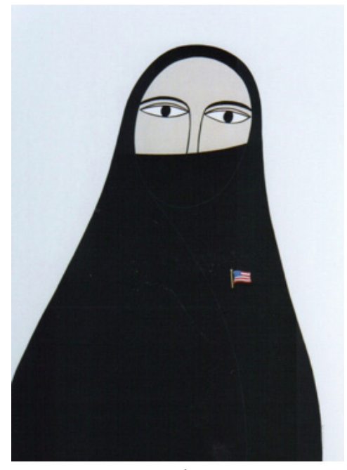
Figure 3: Abaya with Flag Pin by Helen Zughaib

Helen Zughaib, born in Beirut, Lebanon, came to the US to study art. Her colorful work visualizes Arab American life, focusing on women in particular (http://hzughaib.com/press.html). In viewing her work, students could be asked, "What does it mean to be American?" "What does an American look like?" "What stereotypes are associated with being American?" Students could then find magazine images of 'Americans' or create drawings. The teacher could display students' images alongside art works such as Zughaib's (see Figure 3) and begin a conversation about stereotypes and how they affect our perspectives and attitudes. Students might then be asked to examine popular video games for images of 'Americans' and use critical discourse to address how these games perpetuate stereotypes.