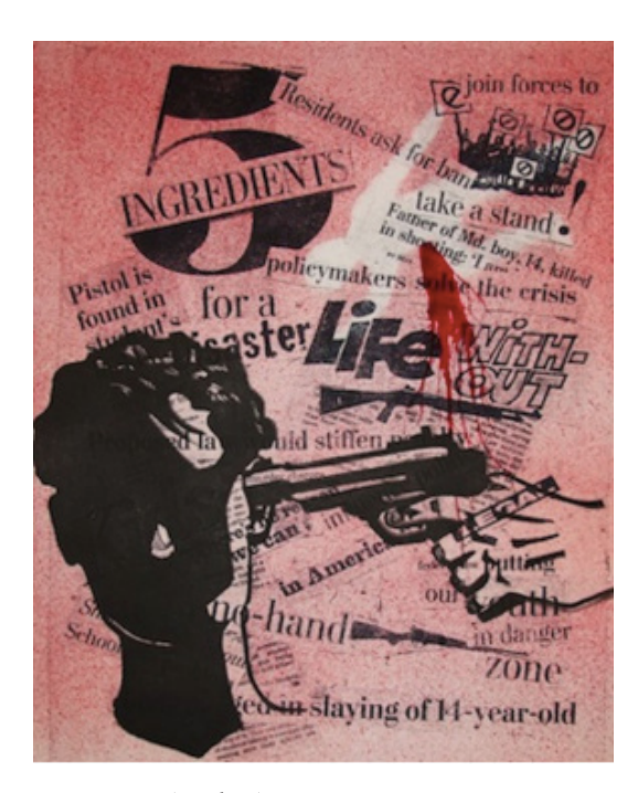
Figure 2. Recipe for Disaster (Author)