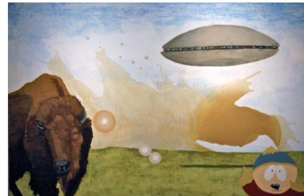
Figure 5. Frank Buffalo Hyde. Buffalo Field #20 Mothership , 2012, [Painting] Acrylic on Canvas, 40" x 60" http://frankbuffalohyde.com/zoom/1400x720/2595641.html Courtesy of the artist.

where he helped watch over his tribe's buffalo herd. In his artwork, he uses the buffalo as "an allegory for North America" (Rangel, 2012, p. 158). Hunted almost to the point of extinction, the buffalo is "an important symbol for Native American people who valued the animal" (p. 158). According to Hyde, his buffalos often gaze at the viewer as a "homicide detective, always there, witnessing and observing" (ibid). The concept is shown in Buffalo Field with Mother Ship (see Figure 5), which asks the viewer "to examine their perceptions of Native Americans and contemporary Native art" (p. 158). Hyde uses the landscape to convey "timelessness" with paranormal elements such as orbs or UFOs, and humor by including the South Park character Cartman. Rangel observes an "underlying connection to settler colonization and manifest destiny as the mother ship is hovering over seemingly unclaimed land" (p. 159). Lowry and Hyde's work exemplify art as counter-image/storytelling by indigenizing the symbols and disrupting the colonial gaze.