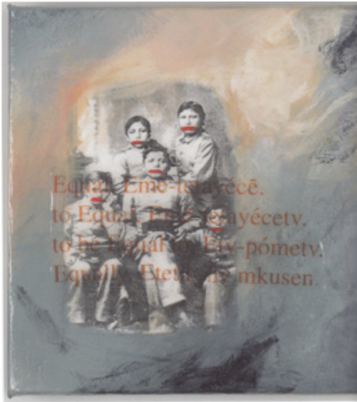
Figure 8. Steven Deo, Indoctrination #3 , 2000, mixed media, collection of the artist.

End of the Trail reflects the history of Deo's ancestors. In 1830, Congress passed and President Andrew Jackson signed the Indian Removal Act, mandating the removal of Cherokee, Choctaw, Chickasaw, Muscogee Creek, and Seminole from their homelands east of the Mississippi to Oklahoma even though the U.S. Supreme Court had ruled in favor of the Cherokee's lawsuit to stay in their homeland. Between 1831-1837, hundreds of thousands of people were forced to walk the "Trail of Tears" to Oklahoma, sometimes during frigid winter weather, where many suffered and died.