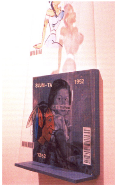
Figure 10. Charlene Teters, What I Know About Indians: Slum-Ta Self-Portrait , 1991, Installation, (Touchette, 2003, p. 7)