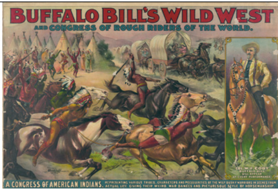
Figure 3. Poster, Buffalo Bill's Wild West and Congress of Rough Riders of the World . 1899. Retrieved from http://img0.etsystatic.com/005/0/6847292/il_fullxfull.374180536_qrww.jpg