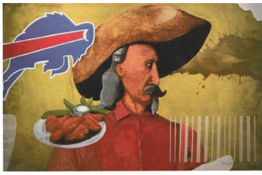
Figure 4. Frank Buffalo Hyde, Buffalo Bill #1 , 2012, acrylic on canvas, 40" x 60" http://frankbuffalohyde.com/artwork/2595646_Buffalo_Bill_1.html Courtesy of the artist.

where he helped watch over his tribe's buffalo herd. In his artwork, he uses the buffalo as "an allegory for North America" (Rangel, 2012, p. 158). Hunted almost to the point of extinction, the buffalo is "an important symbol for Native American people who valued the animal" (p. 158). According to Hyde, his buffalos often gaze at the viewer as a "homicide detective, always there, witnessing and observing" (ibid). The concept is shown in Buffalo Field with Mother Ship (see Figure 5), which asks the viewer "to examine their perceptions of Native Americans and contemporary Native art" (p. 158). Hyde uses the landscape to convey "timelessness" with paranormal elements such as orbs or UFOs, and humor by including the South Park character Cartman. Rangel observes an "underlying connection to settler colonization and manifest destiny as the mother ship is hovering over seemingly unclaimed land" (p. 159). Lowry and Hyde's work exemplify art as counter-image/storytelling by indigenizing the symbols and disrupting the colonial gaze.