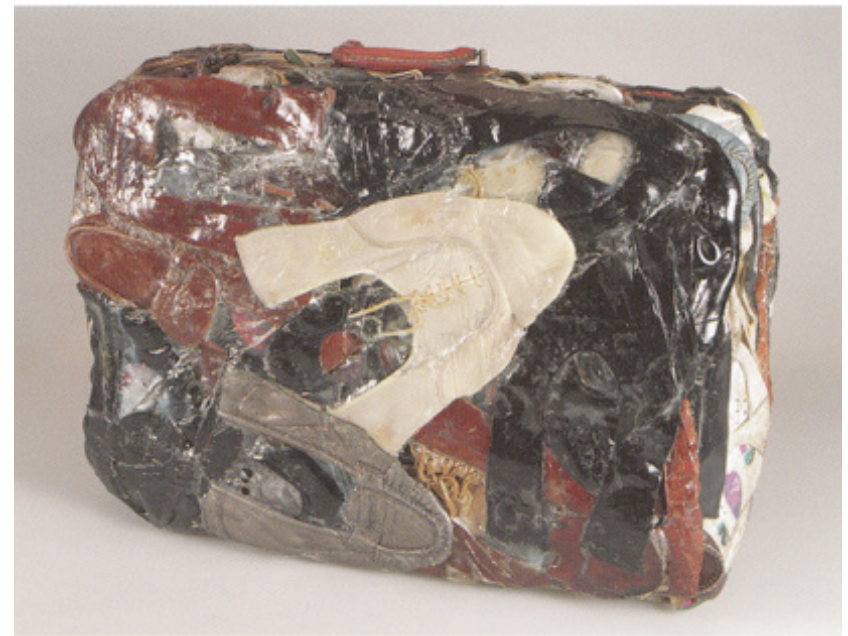
Figure 9. Steven Deo, End of the Trail . 2000, mixed media, shoes, 18"H X 26"W X 10"D.

The Museum of Contemporary Native Arts (MoCNA), the only Native-run museum of contemporary art in the country, is another resource for teachers seeking information. Their free online curriculum entitled Manifestations (Mithlo, 2011a) is intended to compliment the book New Native Art Criticism: Manifestations (Mithlo, 2011b). The book includes historical essays, photographs of artworks, and biographies about 60 contemporary Native artists written by 14 Indigenous authors. It is a rich research tool that teachers can use to