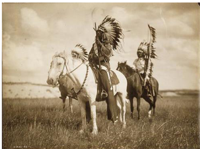
Figure 1. Curtis, E.S., Sioux chiefs , photograph, 1905, 15.1 x 20.2 cm. Retrieved from http://cdn.loc.gov/service/pnp/cph/3g10000/3g12000/3g12400/3g12466r.jpg Washington, D.C: Library of Congress Prints and Photographs Division.

Rangel (2012) applies concepts of relationships, community, hybridity, counter-storytelling, survivance, and indigenization of space to Indigenous aesthetics. Indigenous relationships signify connections to community and respect for the earth, families, and traditions. Many Native people experience hybridity by participating in many cultural, ethnic, national, and spiritual spheres as a member of a sovereign nation within a colonial country. Survivance (Vizenor, 1999), a combination of survival and resistance, might be enacted through counter-storytelling. The "indigenization of space occurs when Native artists reclaim a location through art or performance" (Rangel, 2012, p. 34).