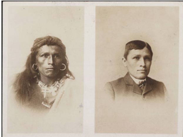
Figure 6. Tom Torlino, Navajo, Carlisle School Student, before and after circa 1882, public domain photograph. http://upload.wikimedia.org/wikipedia/commons/2/24/Tom_Torlino_Navajo_before_and_after_circa_1882.jpg