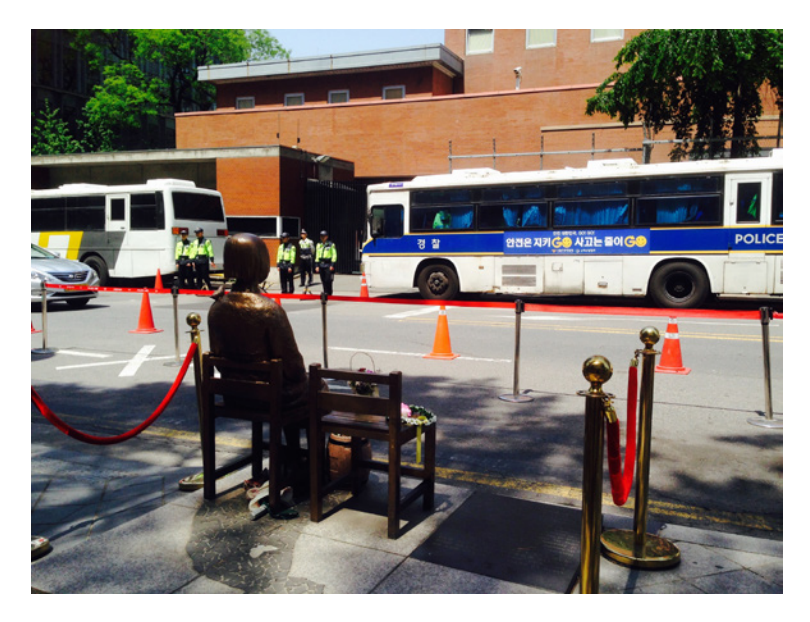
Figure 2. Kim, S., & Kim, W. (2011). The statue of peace [Sculpture]. Seoul, Republic of Korea: The Korean Council for the Women Drafted for Military Sexual Slavery by Japan.

The girl who was abducted to become a comfort woman stares at the Japanese embassy.