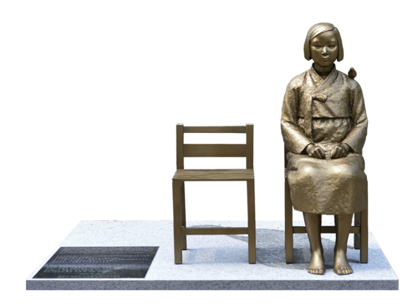
Figure 1. Kim, S., & Kim, W. (2011). The statue of peace [Sculpture]. Seoul, Republic of Korea: The Korean Council for the Women Drafted for Military Sexual Slavery by Japan.