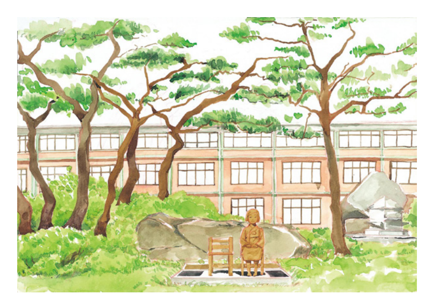
Figure 5. Kim, S. (2017). The statue of peace in Jecheon, North Chungcheong Province, South Korea [Painting]. Watercolor on paper, 10.7"x15.5". Copyright 2017 by Se-jin Kim. Reproduced with permission.

Similarly, students can propose works based on their discussions about the multi-layered symbols of memorial art, the relationship between local sites, relevant issues and their power discourses, and globalization (i.e., Brookhaven advocating against sex trafficking, the Center for Civil and Human Rights' refusal to erect a statue in Atlanta, Asian countries depicted in the San Francisco statue and their contribution to the global perspective on the issue of comfort women, and possible cultural binaries that these statues may produce). When students articulate their ideas and create their own visual symbols as diverse means to approach globalization, they can contribute to anticolonial and counterhegemonic forms of globalization.