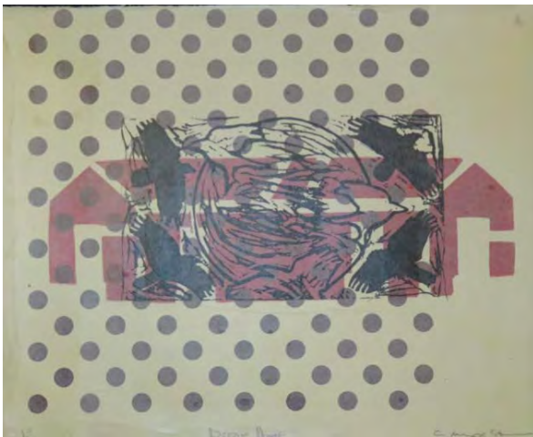
Figure 9. C. Maxx Stevens. Dream Home . 2016. relief, stencils, Usuyo Gampi paper. 15”x19”