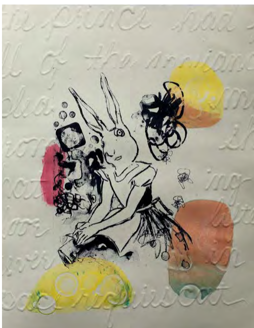
Figure 12. Neil Ambrose-Smith. I'm a mobile home . 2016. acrylic lithograph, embossment, Akua monotype. 19"x15"

Such sacred wholeness fulfills the qualities of a human being as a generous caretaker who is respectful of those who came before and