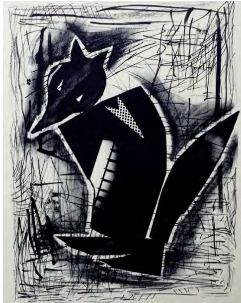
Figure 2. Jaune Quick-to-See-Smith. Home is where the Heart is . 2016. waterless lithography. 19"x15"