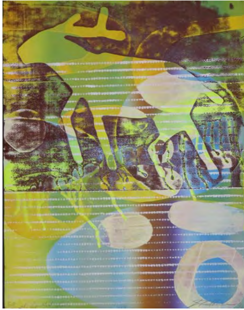
Figure 5. Joe Feddersen. Elk at Spotted Lake . 2016. monoprint, spray paint, relief print, stamp, varied. 19"x15"