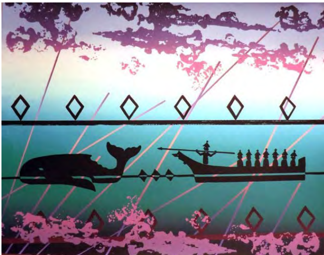
Figure 6. Alexander Swiftwater McCarty. A Successful Whale Hunt . 2016. serigraphy, BFK