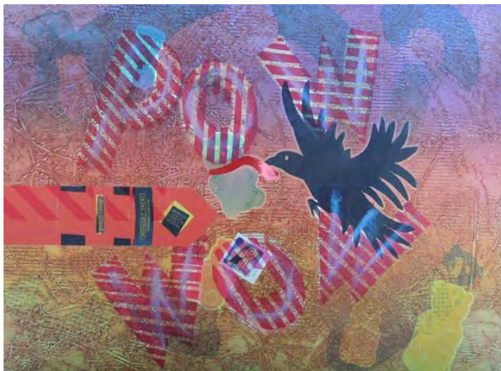
Figure 4. Corwin Clairmont. Raven After Gummy Bear's Donald Trump - Made in China - Signature Collection Silk Tie. 2016. monoprint, collograph, relief, BFK Rives paper, chine collé, xerox on acid free cotton paper, holographic film, bronzing powder, 15"x19"

Home is affected by the natural world around us and by individuals and organization that may have influence and power. Raven: attracted to bright shiny things, is much like the bigger than life image of Donald Trump, as many are attracted to the flash and flare. The gummy bear is being questioned by the raven who thinks that the red flashy tie might not be in the bear's best interest. (Figure 4)