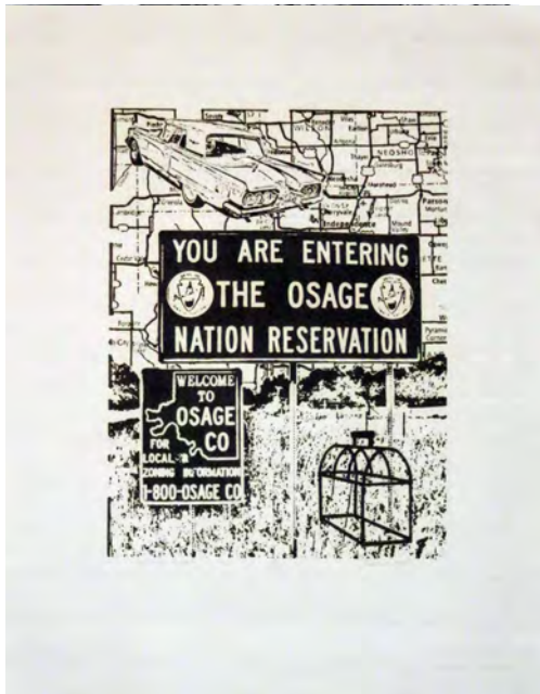
Figure 3. Norman Akers. Welcome Home . 2016. screenprint. 19"x15"

The signage serves as a reminder of a history rooted in a nineteenth century attitude of Manifest Destiny and the series of government treaties that have reshaped and diminished our original homelands. These signs are a testament to the complex history surrounding removal and a place we now call home. (Figure 3)