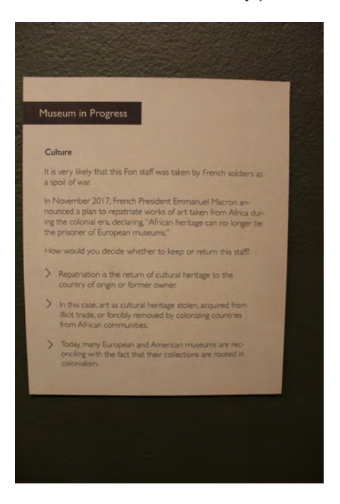
Figure 8. Museum in Progress label posing questions to visitors about repatriation of African objects.

are going to do African art and its makers any justice.