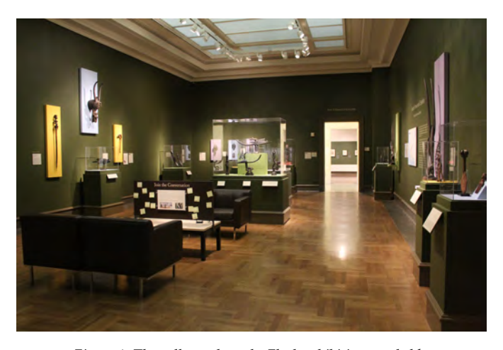
Figure 1. The gallery where the Floch exhibition was held

These questions create a reflective exhibition development process that centers non-dominant voices. This new centering practice allows for museum curators, visitors and museum educators to interrogate Whiteness and hold ourselves accountable for perpetuating it while making room for us to reframe silenced identities as powerful, valuable, and necessary. It requires us to build community relationships, engage in self-reflection, and critically think about how information allows for authentic interactions with the objects and the histories that envelope them. As a result, we are able to learn to question why what we've been socialized to believe counts as knowledge.