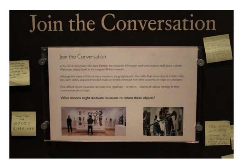
Figure 4. The Conversation Station

Three examples of strategies were used to execute the interpretation plan. Each offered an alternative view of African cultural groups, made connections between the objects and contemporary discussions, and highlighted local Africans. First, a color-coded ethnolinguistic map of Africa (a map that identified different African cultures by the languages they speak) is incorporated into the exhibition instead of a map focused on geography. In this way, visitors are encouraged to focus on where cultural groups occupied space prior to the creation of arbitrary colonial country lines. The second strategy is the "Join the Conversation Station."