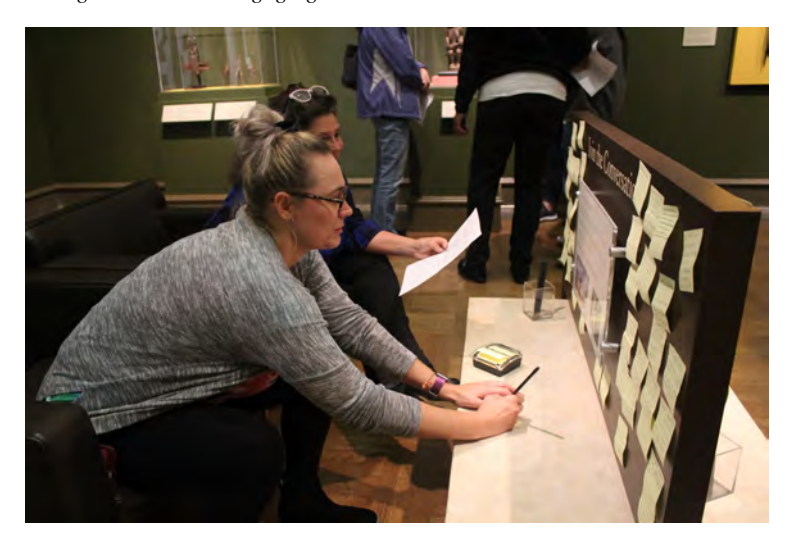
Figure 6. Visitors engaging with each other at The Conversation Station