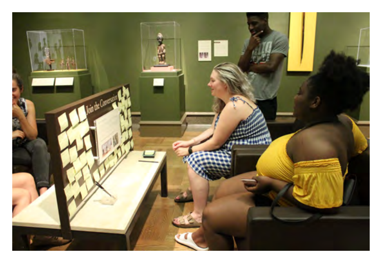
Figure 5. Visitors engaging with each other at The Conversation Station