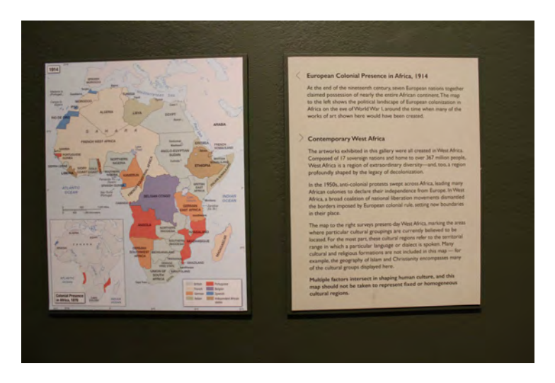
Figure 3. Colonial map of Africa in 1878