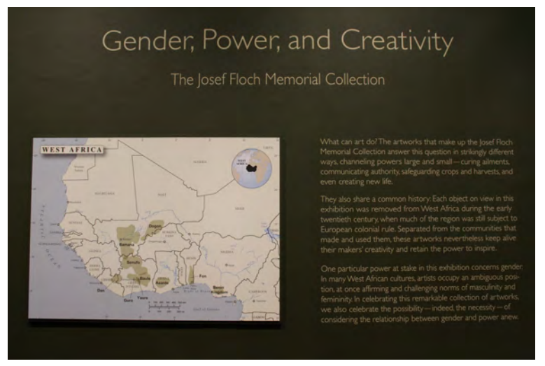
Figure 7. Exhibition label with map of west African highlighting cultural groups. It also explains how the exhibition questions power, colonization, and gender norms.

The exhibition text offers less information on the donor and more history on the ways the artworks were obtained.