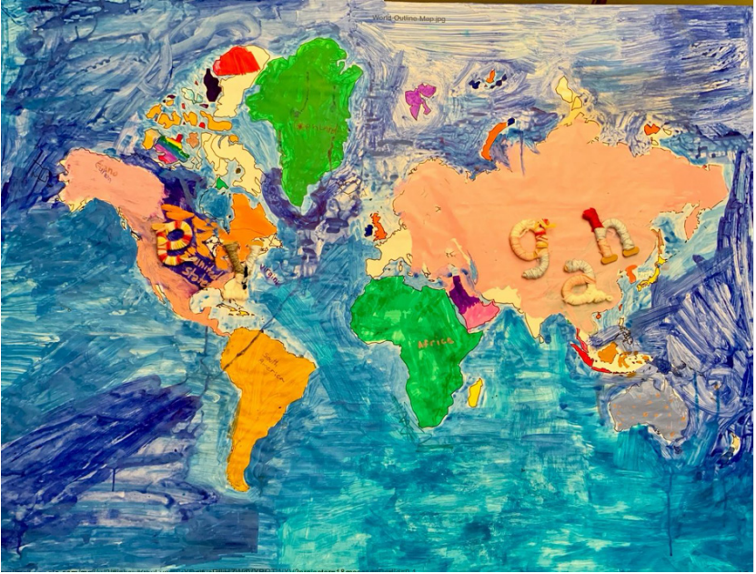
Figure 4. A world map mural, Us and the World