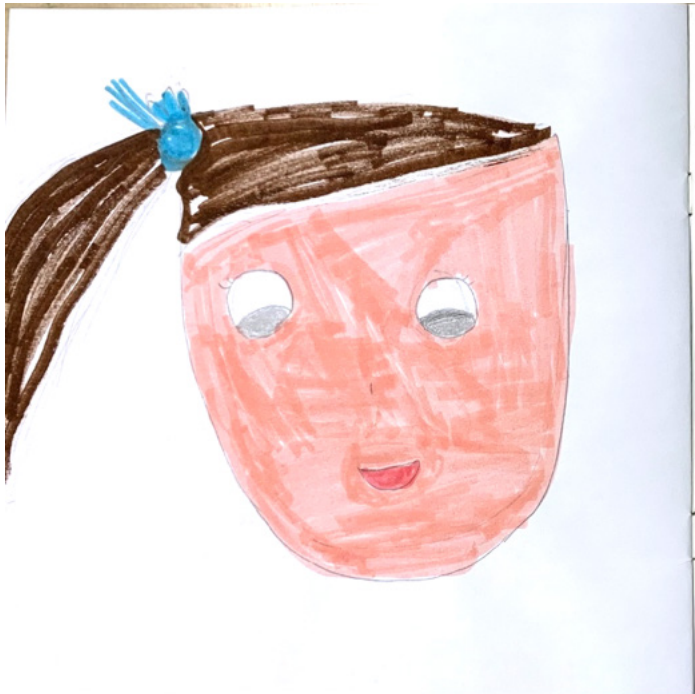
Figure 2. A student's self portrait