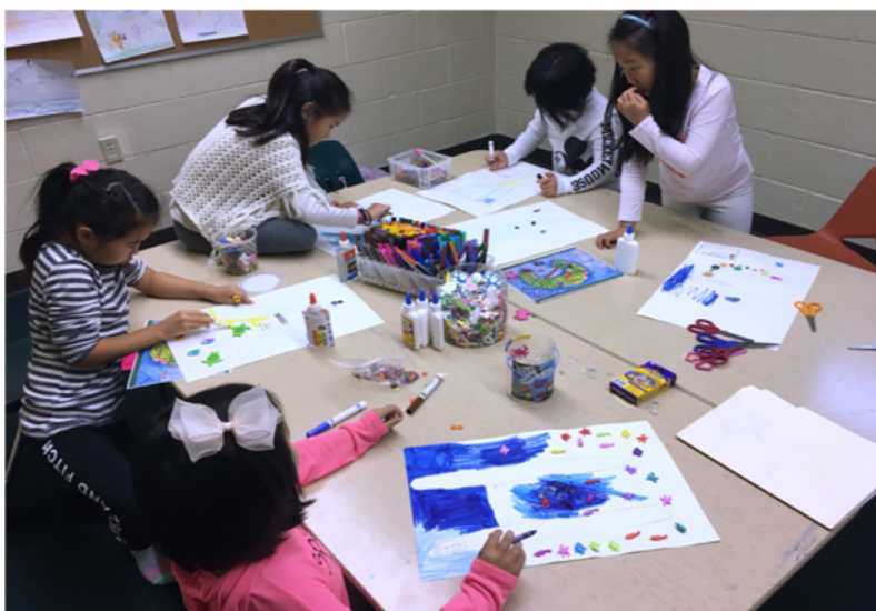
Figure 1. Students in my art class at a Korean church in the Midwest

A qualitative approach in which the investigator explores a real-life, contemporary bounded system (a case) ... over time, through detailed, in-depth data collection involving multiple sources of information ... and reports a case description and case themes (p. 96-97).