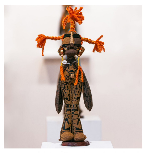
Figure 1. Jalethal Doll (Orange) Mixed Media (2019)