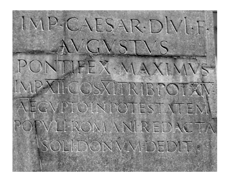
Figure 1: inscription on the base of the obelisk of Psamtek II erected by Augustus in the Campus Martius; now located in front of Palazzo Montecitorio, Rome.

The plinths supporting the obelisks set up by Augustus (Figure 1) each bear the same simple inscription which, at first sight, is largely a summary of Augustus' titles and achievements. The texts may be viewed as further examples of selfaggrandizement to reinforce his political status; Augustus' attempt to commemorate and immortalize himself in monumental architecture. The message Aegypto in potestatum populi Romani redacta predicts that later given in the passage in the Res Gestae confirming that Egypt had been passed to the control of the Roman people. Taken together, these remarks satisfy the commemorative and political functions attributed by Pliny and others to the obelisk and the final comment, Soli Donum Dedit - he gave this as a gift to Sol (the sun god)<sup>47</sup> alludes to the religious aspect. However, in an assessment of Augustus' motivation for his use of Egyptian obelisks in the Roman landscape it seems pertinent to consider the extent to which the early commentators were accurate in their assessment of the functions of obelisks as, while the present understanding of obelisks – as commemorative objects, or objects primarily set up in honor of, or as gifts to, the gods - may originate from information passed down from Pliny, Ammianus, and their contemporaries, reliance on these ancient reports may be misleading.