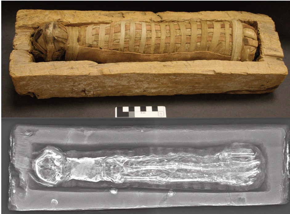
FIGURE 1: Photograph and radiograph of a mummy containing a complete and articulated cat skeleton (56.21.547; World Museum Liverpool). Reproduced with permission of World Museum Liverpool and Manchester University NHS Foundation Trust.

example, mummies may have been created from materials other than a complete animal body when whole specimens of the required animals were in short supply, or when the devotee could not afford to acquire a more complete specimen. 11 This kind of substitution is not necessarily the consequence of deception, and the term “ersatz” may be more appropriate in this instance.