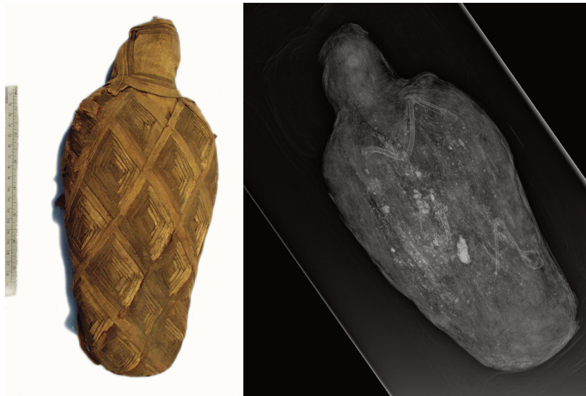
FIGURE 2: Photograph and radiograph of a mummy containing a partial skeleton of a common kestrel ( Falco tinnunculus ) and a number of elements from a smaller bird (TN4295; Manchester Museum).

Ancient Egyptians may have believed that any materials that came into contact with sacred animals, or were found within a sacred precinct, could be considered to be equally effective as votive offerings. 12 The principle of synecdoche (the concept of the part acting for the whole) has been widely accepted in relation to ancient Greek and Roman votive offerings and might apply to Egypt as well, especially during the Late to Roman periods, which saw not only heightened contact with Greco-Roman culture but