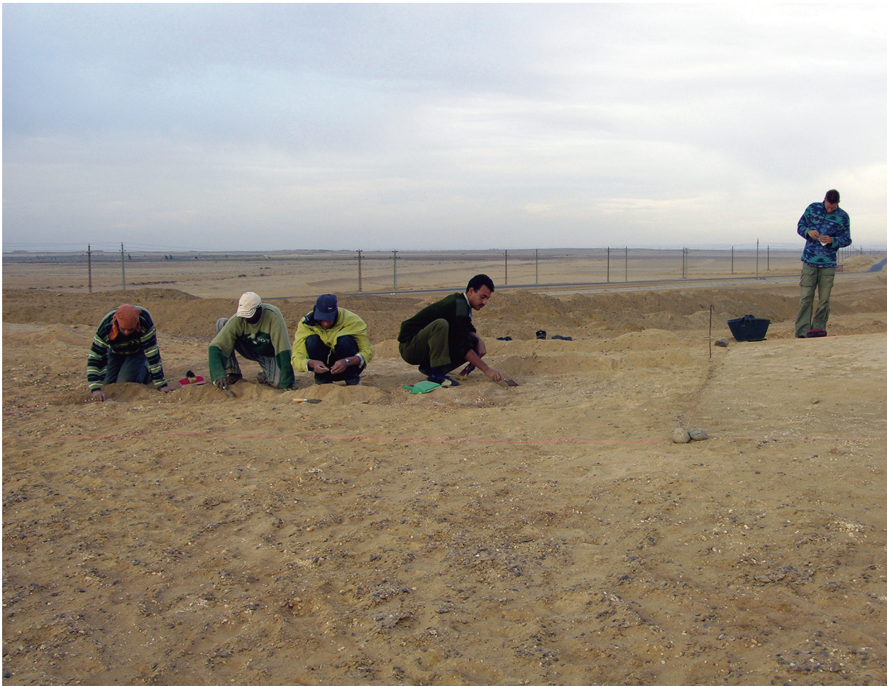
FIGURE 5: The Fayum Neolithic Team, including inspector Ashraf Sobhy and policeman Mustafa Ayoub (URU Fayum Project).

Archaeological method, theory and practice today need to take into account insights from poststructuralist, postcolonial, and gender theory critiques. The way to do this is to be well aware that the current research relationships are determined by a past and present built on inequality. Six guidelines