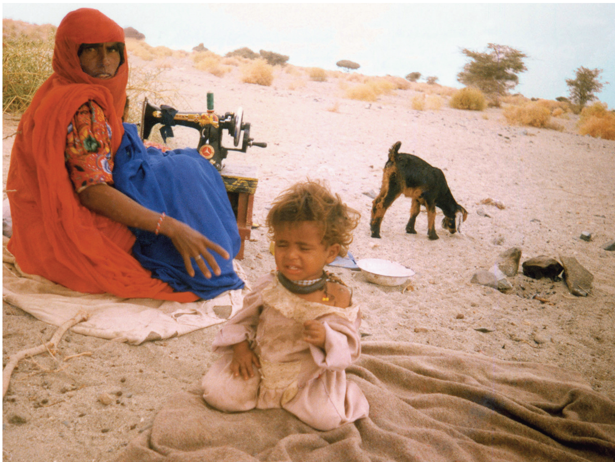
FIGURE 4: Sewing clothes in the desert.

In the first place they selected everything that is needed for the coffee ceremony: a coffee roaster, mortar and pestle to powder the coffee, the jabana coffee pot and the basket in which it could be transported, a wooden carved sugar pot, a basket containing 6 small porcelain coffee cups, a ring to support the jabana , a round mat to fan the fire. The second group of objects were all elements needed to deck out a camel: riding saddle, blanket, saddle bags, tassels, head gear, and a rider's leg protection. The third group of items were a dagger, shield and sword, the last two part of a man's gear, but nowadays only used in a dancing ritual.