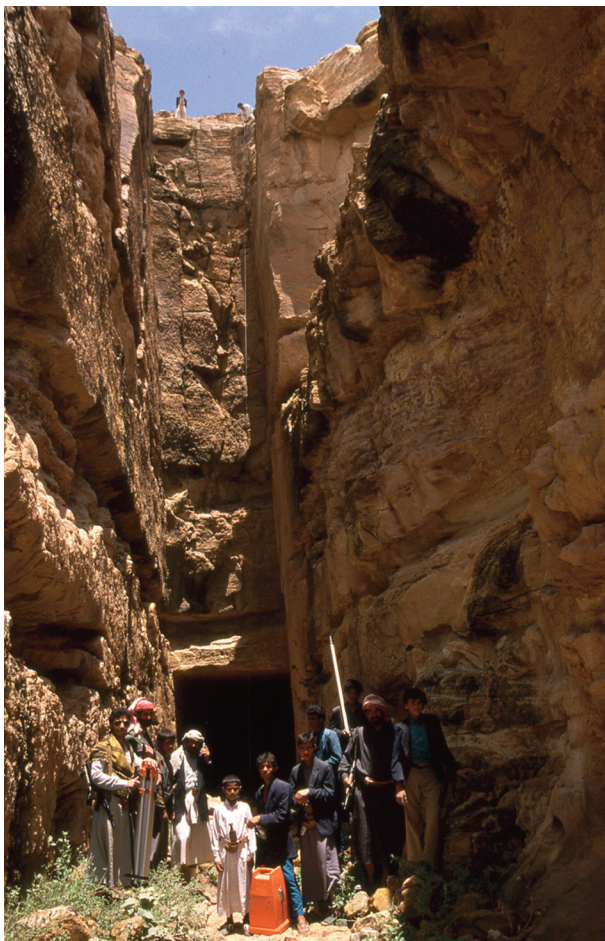
FIGURE 2: (a, above; b, below) Survey assistants carrying ranging rods, tripods and kalashnikoffs. Baynun, Yemen, 1997.