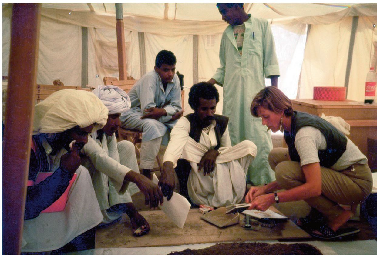
FIGURE 3: Ababda training program in Berenike.

from Quft. It meant that we needed to train our local collaborators in basic excavation techniques, rather than have them supervised by an experienced foreman from Quft. In the complicated social network of the Red Sea mountains, this was a good approach. The Ababda comprise a number of "tribes" ( kabila ), each with a sheikh who represents their interests. These groups differ in the way they interact with "Egypt," meaning the Nile Valley and those towns along the Red Sea coast that are under tight control of the Egyptian government. In the 1990s in an area of 5 km around the ancient site, one group was settled in government-built concrete houses, in a village which also had a large government provided water tank, a defunct clinic and a school. The other group lived spread out in the landscape and the wadis of the Eastern Desert. The excavation had to make sure that the men hired to work with us were divided equally between these two major tribes. A third group, consisting of young Ababda men who were from families that had settled in the Nile Valley, came to work with us as