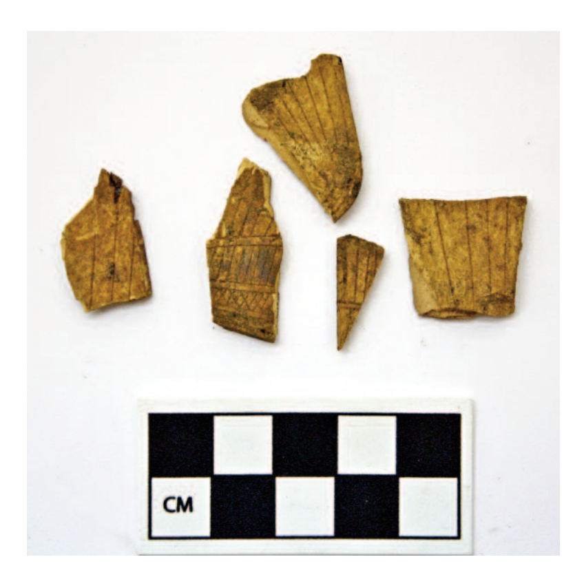
FIGURE 3: Ivory box fragments from the Phase RG-4a gate destruction (JCHP 307).