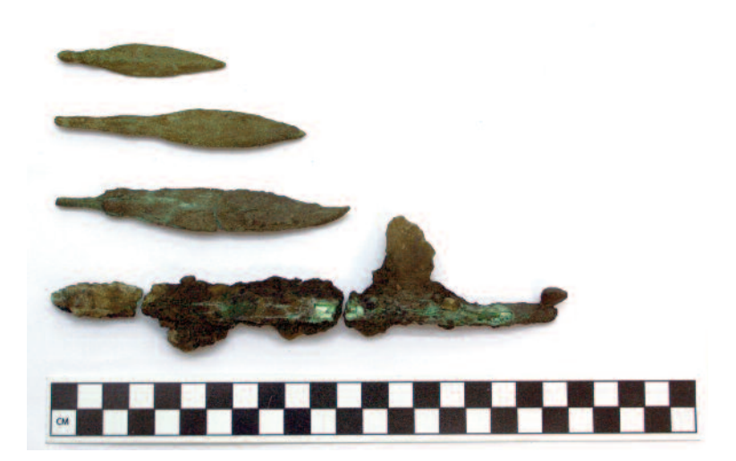
FIGURE 1: Metal finds (JCHP 300, 325, 327, and 361) from the Phase RG-4a gate destruction (photograph by the JCHP).