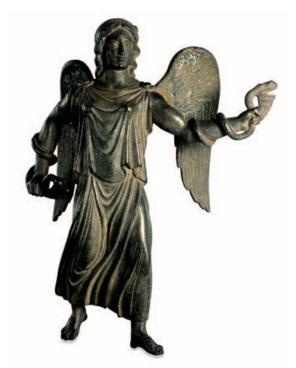
FIGURE 8: Bronze statuette of Vanth featuring two bearded snakes coiling around her arms, ca. 425–400 BCE.

underground chamber combine to highlight the chthonic aspects of the snakes. The snakes undoubtedly function within Etruscan concepts of the Underworld and not Greek myth.