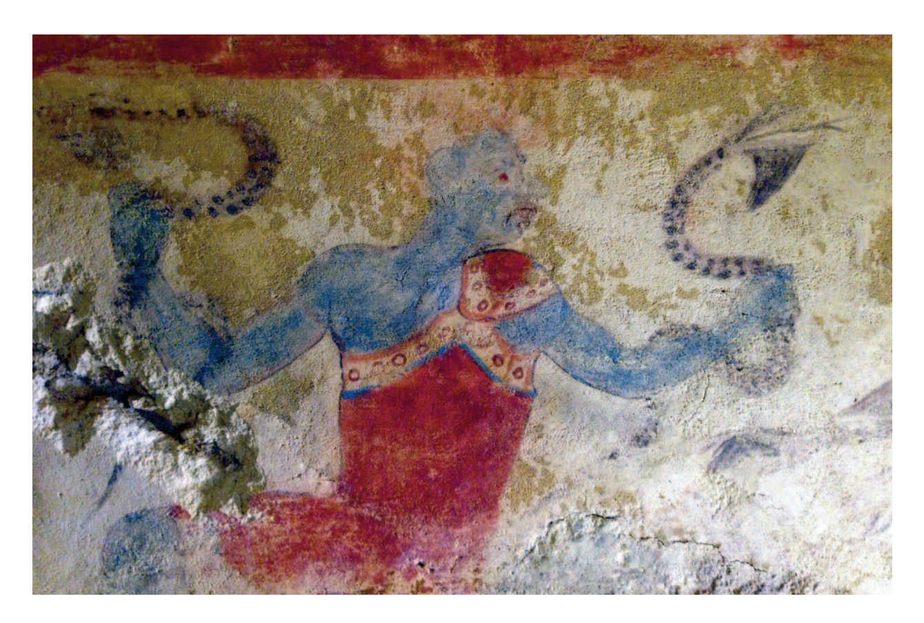
FIGURE 5: Detail of a blue "demon" on the right side of the Tomb of the Blue Demons, Tarquinia, ca. 400 BCE.

a scene of Herakles and the Hydra.<sup>22</sup> Although the fragments, which date to the end of the 6th century BCE, are without provenience, it is probable that they came from Caere.<sup>23</sup> It is interesting to note that these bearded terracotta snakes were not employed in a funerary context, but rather on a civic or religious building.