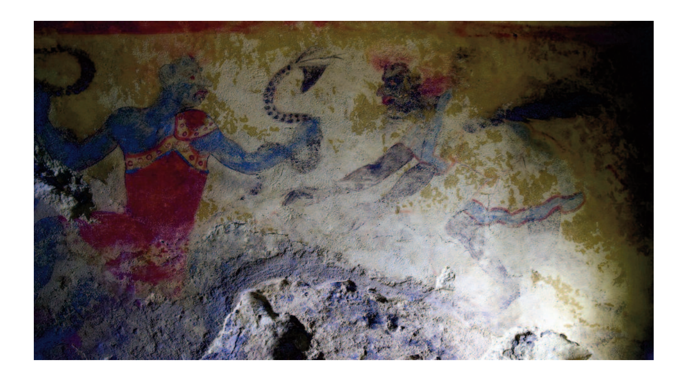
Figure 6: Detail of two Underworld figures on the right wall of the Tomb of the Blue Demons, Tarquinia, ca. 400 BCE.