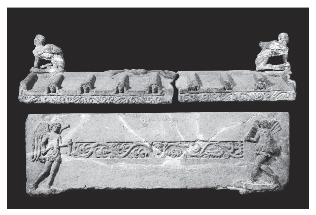
FIGURE 10: Etruscan stone sarcophagus with a lid carved as a roof of temple or house with two coiled snakes atop, ca. 325 BCE, from Grotta Dipinta, Bomarzo.

of the Underworld. He is dressed in a white chiton and winged boots and carries his best-known attribute, a mallet. The figure on the right, a Tuchulcha-like creature, clutches two snakes, at least one of which displays a beard. Using them as weapons, he thrusts the snakes toward the couple. The snakes are not only his attribute; they also assist him as he "exerts power over those who dare break the cosmic order of the Underworld," <sup>31</sup> as Admetus should be going off to die, not his wife.