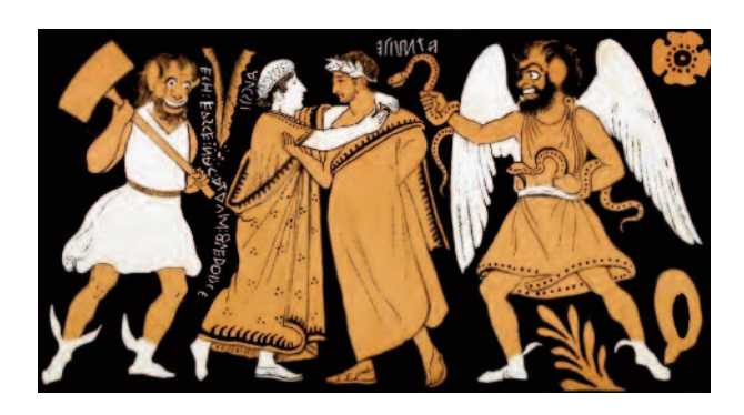
FIGURE 9: Drawing of a detail from an Etruscan volute-krater with Alcestis and Admetus, ca. 350 BCE from the Bibliotheque Nazionale, Paris. After George Dennis, Cities and Cemeteries of Etruria , 3rd edition (London: John Murray, 1883), vol. 2, frontispiece.

Etruscan painted vases are no exception when it comes to images of bearded serpents. One of the most well-known Etruscan red-figure vases from the 4th century BCE shows the Greek myth of Alcestis and Admetus, but in a fully "etruscanized" manner (Fig. 9). On this krater, now housed in the Bibliothèque Nationale in Paris, the lovely couple (identified by their Etruscan names, Alcsti and Amite ) embraces one last time before Alcestis departs for the Underworld (having agreed to die in place of her husband).<sup>29</sup> The actual embrace itself is very Etruscan, as we do not see such contact in Greek representations of this myth.<sup>30</sup> But the flanking underworld figures on the left and right are what give this scene an even deeper local meaning. On the left we see Charu, an Etruscan guardian