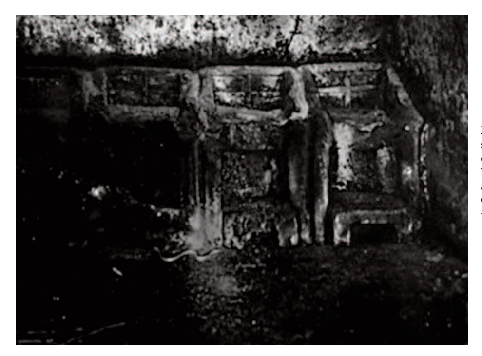
FIGURE 1: An Italian viper slithers alongside the stone-carved footstools in the Tomb of the Five Chairs at ancient Caere (modern Cerveteri).

Seen in the earliest forms of art, snake imagery looms large in the artistic repertoire worldwide. Their highly symbolic form, venomous bite, and the ability to shed their skin make them icons of fertility, fear, and rebirth, to name