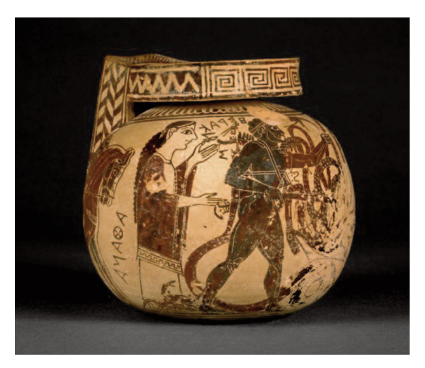
FIGURE 2: A Corinthian aryballos with a scene of the Hydra, first quarter of 6th century BCE. The J. Paul Getty Museum, Los Angeles.

just some of their many symbolic attributes. Therefore, it is not surprising to see the popularity of serpent iconography in Italy. The earliest surviving depictions of snakes in Etruria appear in the Italo-Geometric period. Their presence is primarily decorative and mythical, although larger messages regarding fertility, life, death, and magical properties must have played a role in their visual rhetoric. One such example is seen in a detail from a painted amphora dating to the early 7th century BCE now housed in the Allard Pierson Museum in Amsterdam (inv. 10188). A female (perhaps a goddess?) confronts a three-headed serpent followed by two other serpents. Some scholars have described this figure as Medea, but it is rather unclear (as the Greek myth describes Medea confronting a dragon).<sup>3</sup>