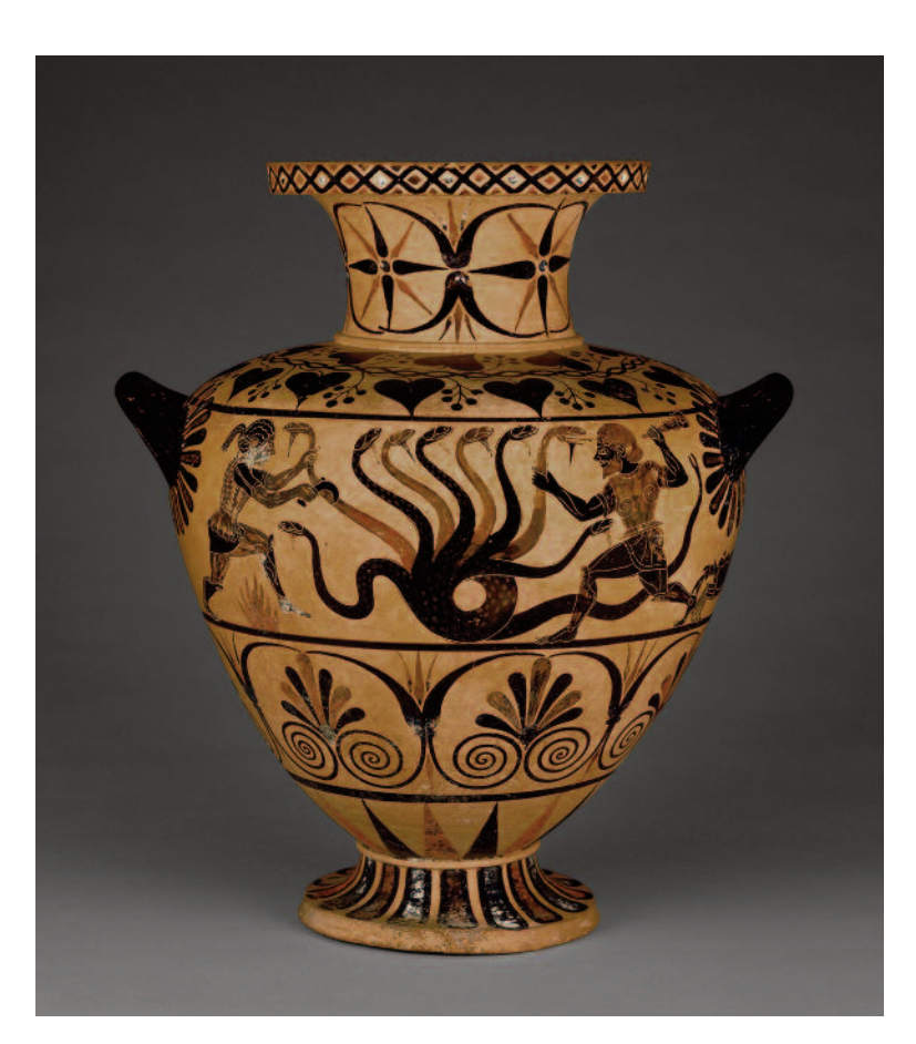
FIGURE 4: Caeretan Hydria with Herakles and the Hydra, attributed to the Eagle Painter, ca. 530 BCE. The J. Paul Getty Museum, Los Angeles (inv. 83.AE.346).