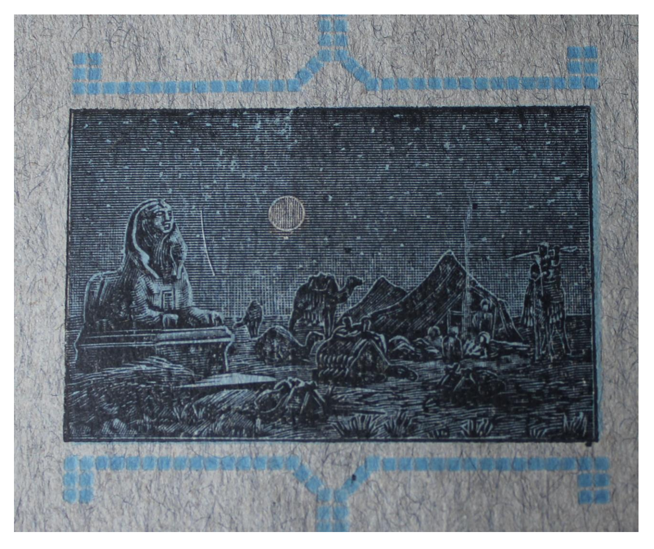
Figure 4: Detail of the picture that decorated the cover page of Roháček's travelogue (1911), drawn most probably by Johannes Warns.