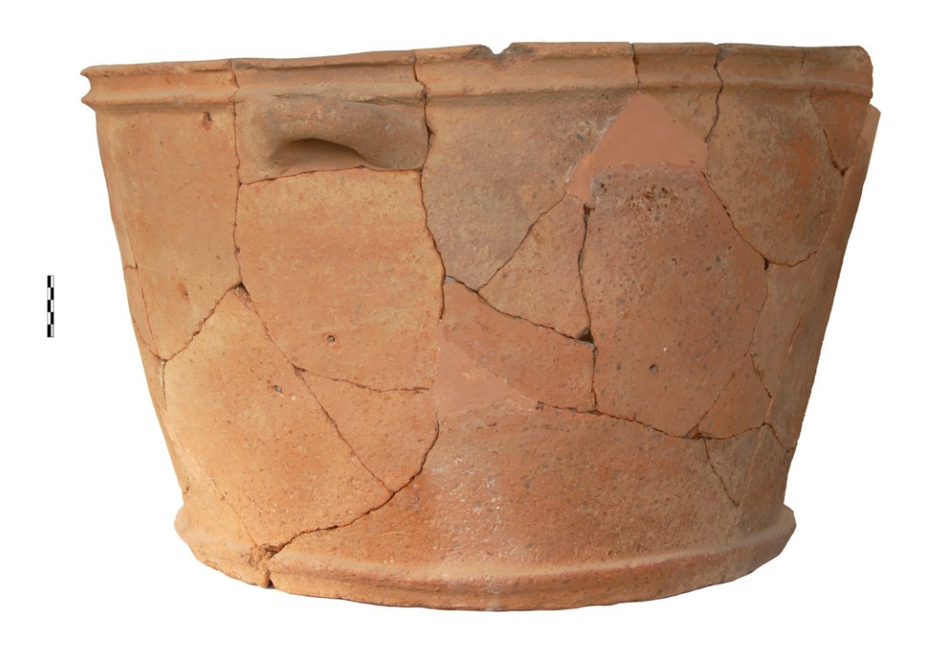
Figure 9: Huge clay spouted vat from the ante-room (A) of the East Building