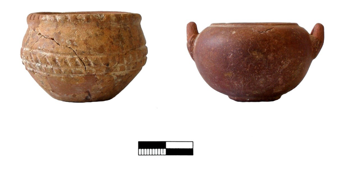
Figure 4: Miniature vessels of stone, probably used as containers for ointments