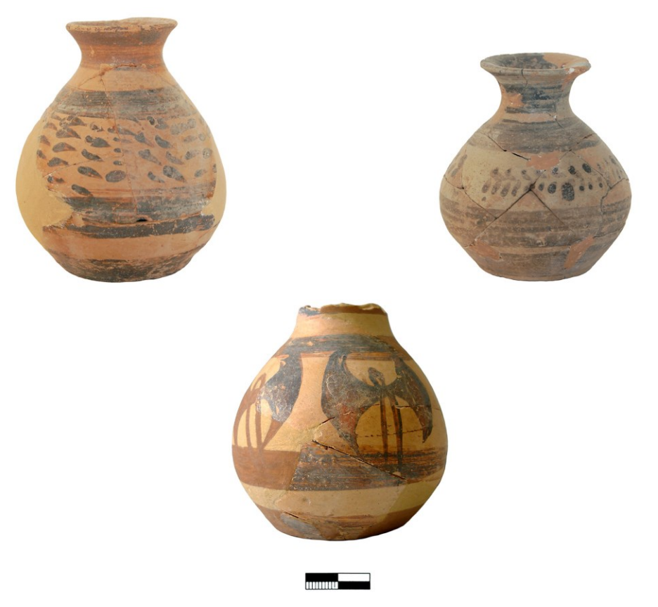
Figure 6: Small-sized clay alabastrons from the East Building, Zakros