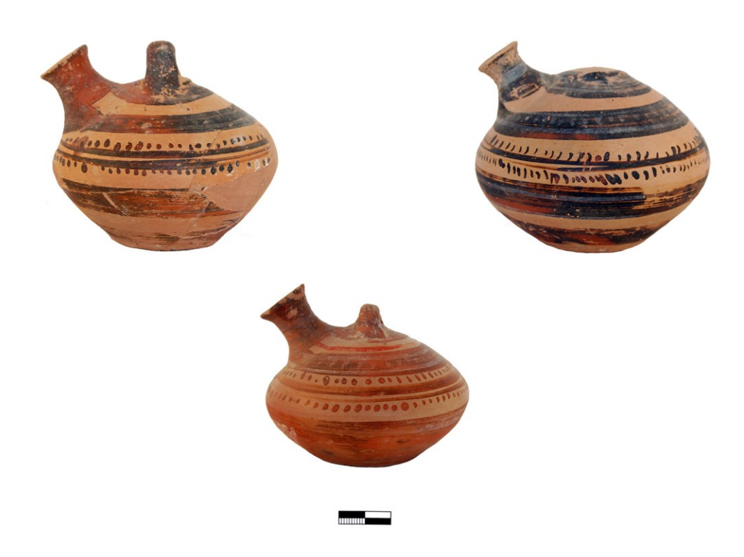
Figure 5: Small clay askoi, probably used as perfume vessels