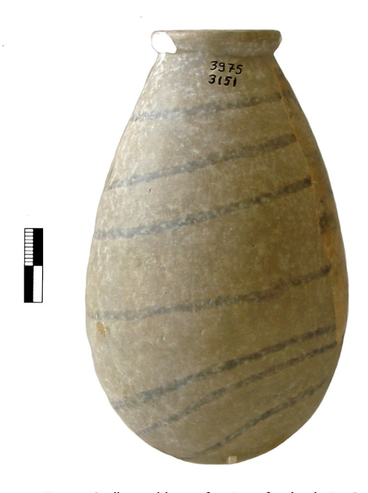
Figure 7: Small stone alabastron from Egypt, found in the East Building