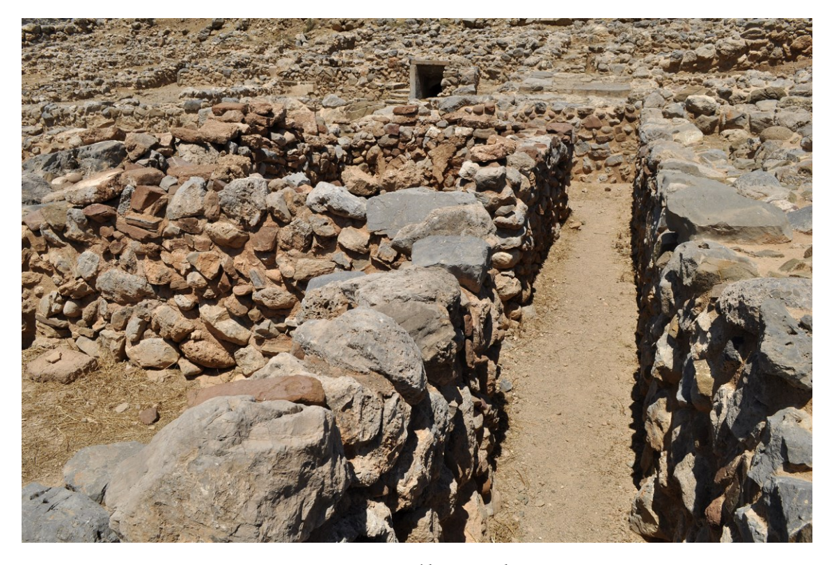
Figure 8: East Building. Corridor \Delta