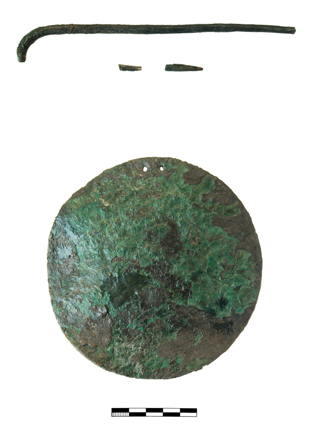
Figure 2: Bronze mirror and pin with a hook-like end