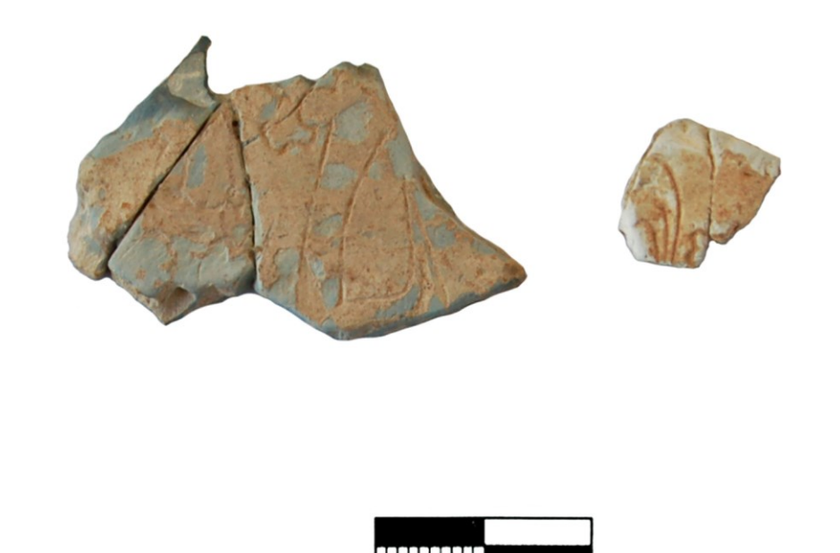
Figure 3: Fragments of small ivory plaques probably depicting a female figure and the motif of the sacral knot