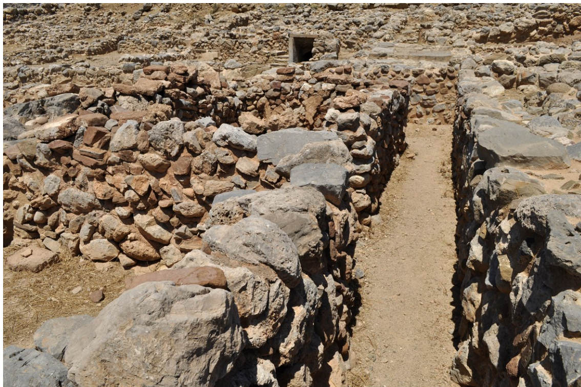
Figure 8: East Building. Corridor Δ