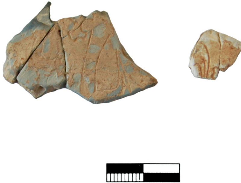
Figure 3: Fragments of small ivory plaques probably depicting a female figure and the motif of the sacral knot