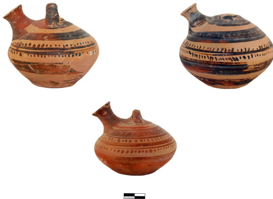
Figure 5: Small clay askoi, probably used as perfume vessels