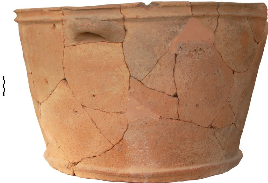
Figure 9: Huge clay spouted vat from the ante-room (A) of the East Building