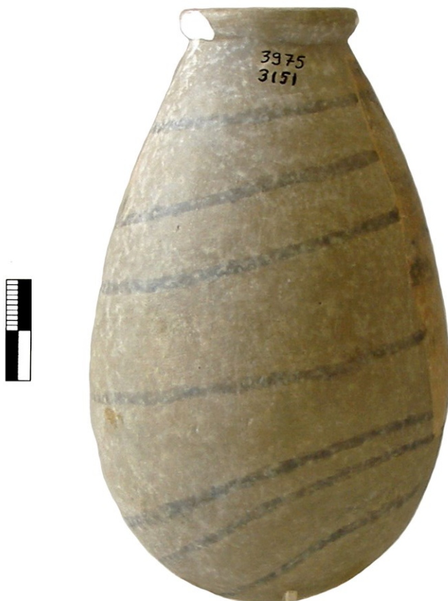
Figure 7: Small stone alabastron from Egypt, found in the East Building