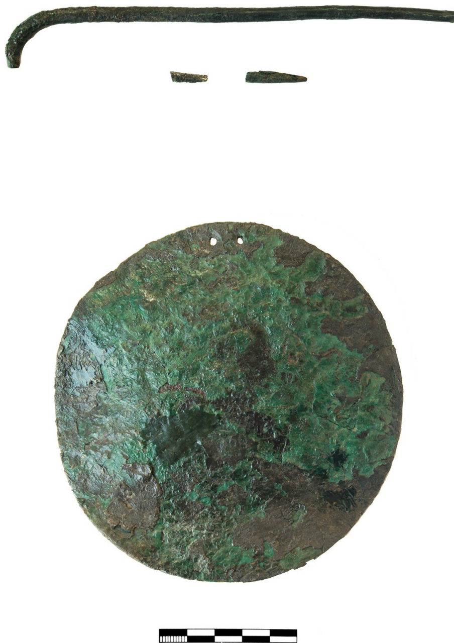
Figure 2: Bronze mirror and pin with a hook-like end