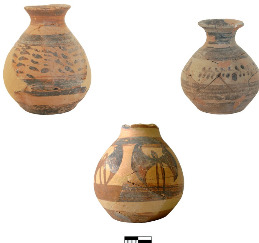
Figure 6: Small-sized clay alabastrons from the East Building, Zakros