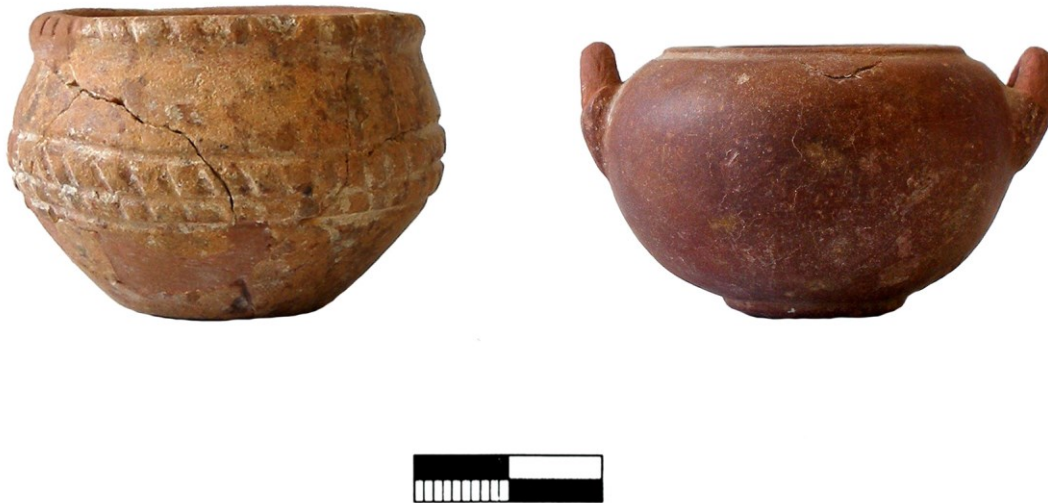
Figure 4: Miniature vessels of stone, probably used as containers for ointments