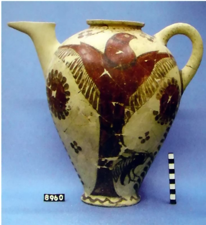
Figure 1: The bird scene on jug 8960, Akrotiri, Thera (after: Papagiannopoulou 2008, 441, Figure 40.15)