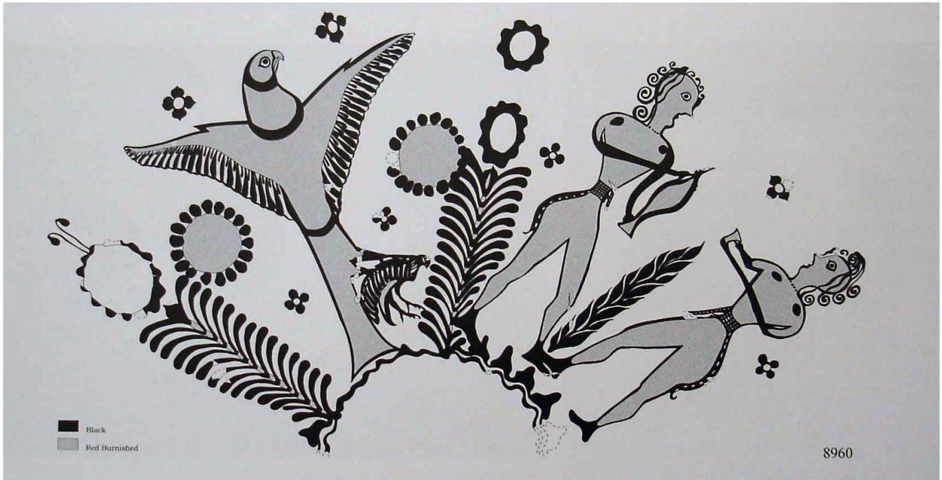
Figure 3: Drawing of the whole scene on jug 8960, Akrotiri, Thera (after: Papagiannopoulou 2008, 442, Figure 40.20)

sun movement in the sky. 18 Following his argument, falcon and sun may be considered as identical concepts.