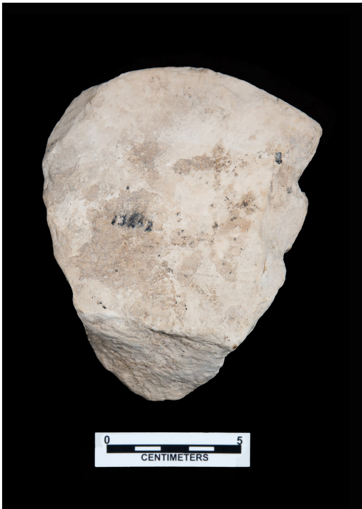
Figure 3: Ptolemaic Royal Portrait, ASM 13202.