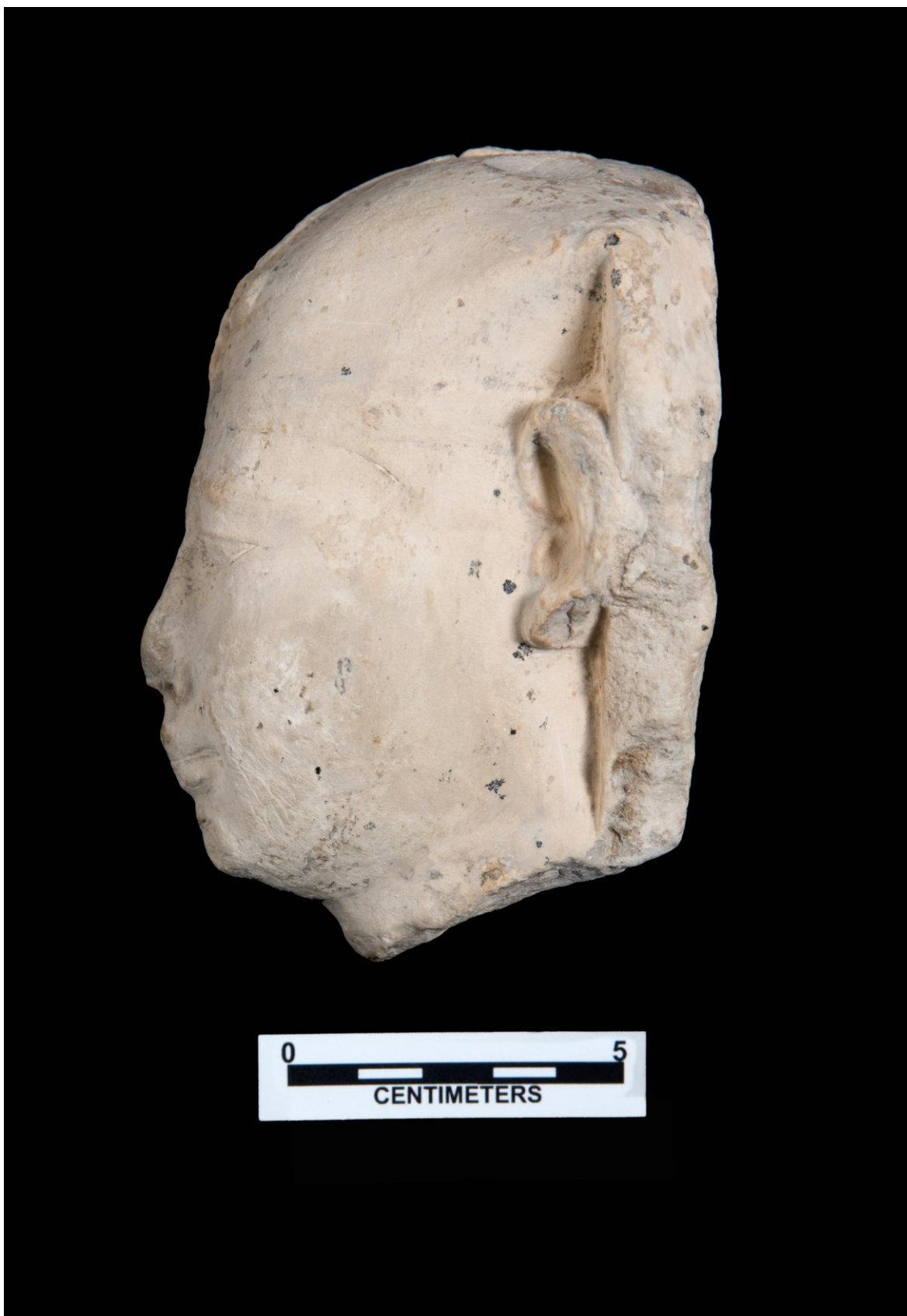
Figure 4: Ptolemaic Royal Portrait, ASM 13202.