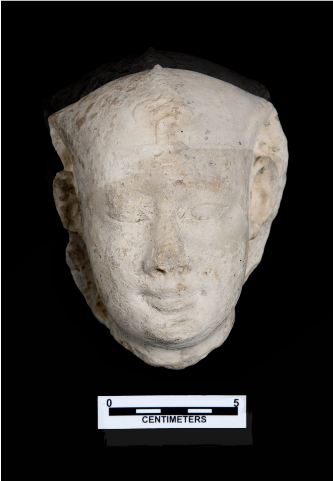
Figure 1: Ptolemaic Royal Portrait, ASM 13202.