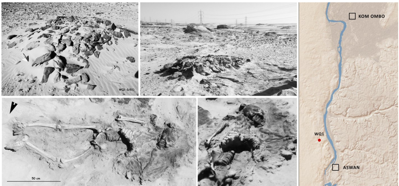
Figure 1: Tumulus WQ1 from West Bank Aswan, possibly Late Meroitic in date (AKAP Archive)

WQ1 is a tumulus located in a small valley to the south of Wadi el-Qurna in West Bank Aswan (Figure 1). It appears to be an isolated grave, but the area is heavily disturbed by the construction of the electric line and desert tracks, thus the