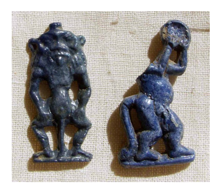
Figure 1: Bes Amulets found in situ on one of a handful of woman buried in flexed Nubian style at Tombos (c. 1350 BC)

the trajectory of Egyptian civilization. Williams also discusses the significance of the fourth cataract in light of the recent salvage campaigns connected with the recent construction of the Merowe Dam. Previously thought of as a largely empty periphery, it is now clear that the region was occupied during this period, with important implications for Egypt's trade networks and interactions with Wawat, Kush, Punt, and the peoples of the Eastern Desert, including the Medjay. He highlights one of the most important recent discoveries expanding the range of Egypt's interconnections with the rest of Africa, the early Middle Kingdom Gebel Uweinat Inscription mentioning Yam. Combined with evidence for the caching of water for caravans on a route running from Dakhla Oasis to the Gilf Kebir, known since the early 20th century but only recently investigated systematically by Rudolph Kuper's ACACIA project,<sup>2</sup> this new evidence strongly implies that Yam was not along the Nubian Nile but located far to the West, most likely Darfur or the area around the Ennedi mountains in Chad.3