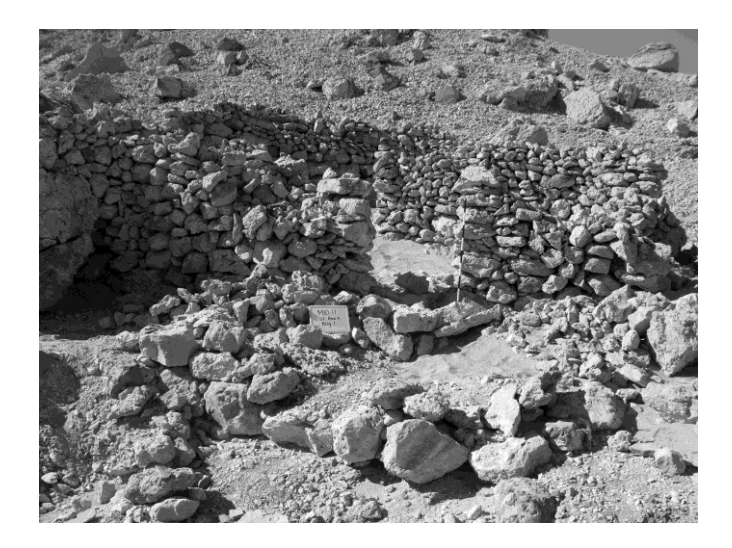
Figure 2: View (looking west) of structure A-1 at M10-11/S1

evidence for a group of Blemmyes settled on an island near Gebelein;<sup>25</sup> whether this settlement of Blemmyes or any other population of Blemmyes has a connection with the settlement at M10-11/S1 is uncertain.<sup>26</sup>