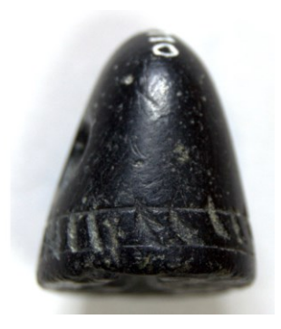
Figure 10: Appendix no. 30. Width of scaling surface 2.05 cm. (Department of Antiquities, Cyprus, Enkomi, Dikaios, no. 1110).

was later partly recarved to include the panels. 145