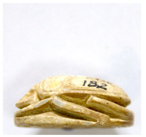
Figure 1: Appendix no. 100. Height of sealing surface 1.9 cm. (Department of Antiquities, Cyprus, Enkomi, Dikaios, no. 182).