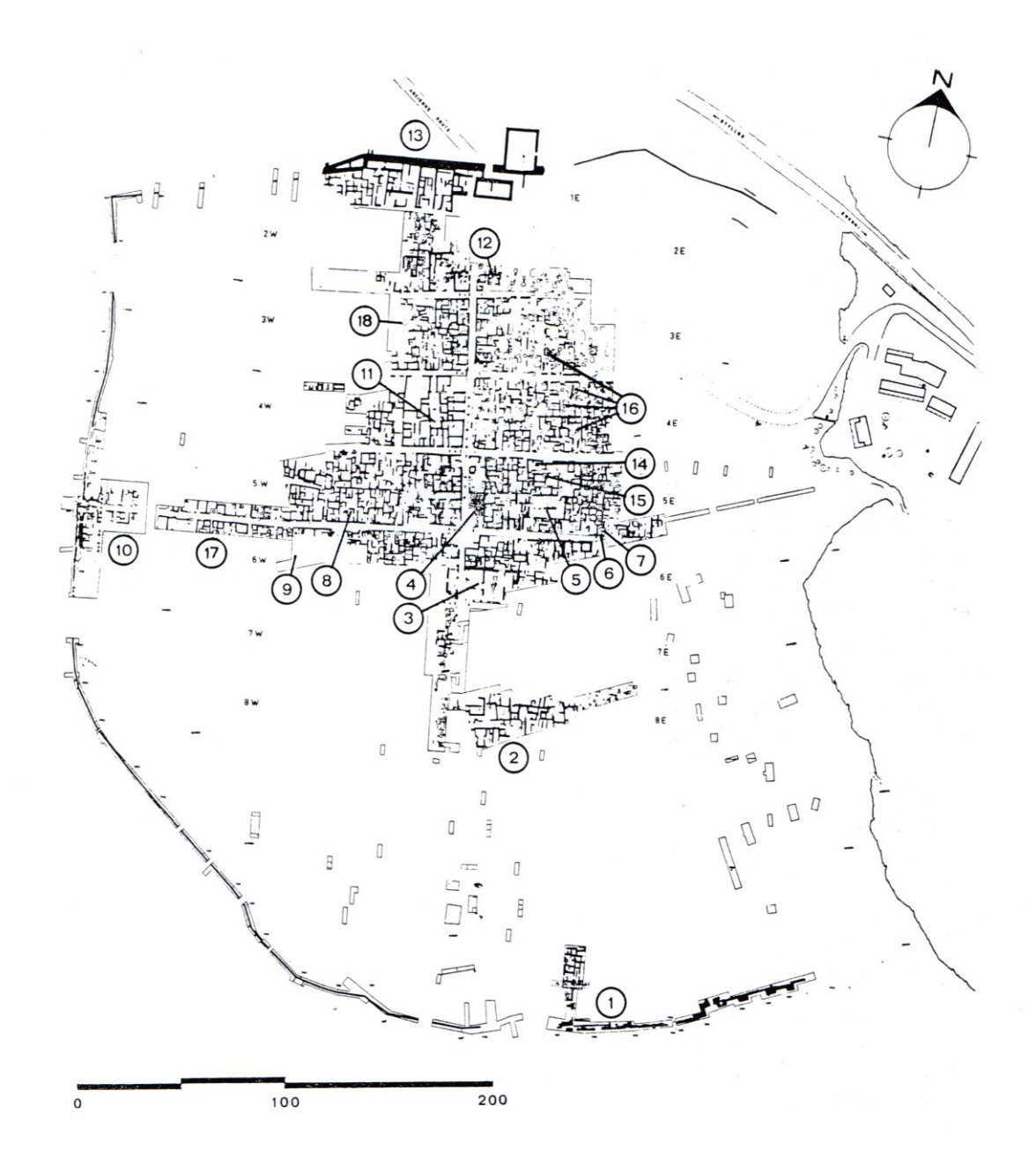
Figure 3: Plan of Enkomi showing arrangement of Quartiers 1E-8W. After Courtois et al. 1986, 3, fig. 1. Key to areas noted on plan that are mentioned in the text: 1. southern rampart (area of enceinte sud); 2. Maison des bronzes (1934); 5. Sanctuary of the Ingot God; 6. French Tomb 5; 7. French Tomb 2; 8. Building 18; 10. Western gate (area of enceinte ouest); 11. Area I of the Cypriot excavations; 12. Maison du trésor des bronzes, 1947; 13. Area III of the Cypriot excavations. For remaining tomb locations see Dalton 2007.

the dung beetle who raised the sun, rolled it across the sky, and buried it at night. In Egypt, the scarab was related to the verb, kheper , which means "coming into existence" and "regeneration," being thus closely tied to the daily cycle of the sun. <sup>12</sup> Scarabs were more often used as amulets than as seals; <sup>13</sup> the most frequent use of scarabs as seals in Egypt was during the late Middle Kingdom. <sup>14</sup> The meanings of regeneration and renewal might not have been transferred along with the scarab shape to other parts of the ancient world. As in Inga Jacobsson's seminal study of Egyptian objects on Cyprus, it is often assumed that the scarab in the