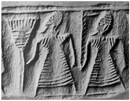
Figure 9: Appendix no. 130. Height of seal 2.2 cm. After Schaeffer 1952, pl. VIII.2, 4 (Schaeffer, no. 5.026).