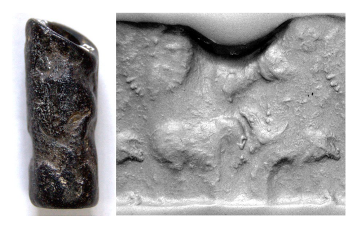
Figures 4a (above) and 4b (below): a: Appendix no. 11. Height of seal 2.15 cm. a. seal and modern impression; b: first (top) and second (bottom) stages of carving (Department of Antiquities, Cyprus, Enkomi, Dikaios, no. 1230). Photographs and illustrations by the author.