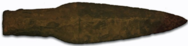
Figure 1: Spearhead found at Buhen. Comparable in dimensions and overall shape to the Mirgissa spearheads, 22.4 X 5.4 cm (BM EA65771)

points that date to the 13 th Dynasty, averaging 20 cm long by 3.17 wide with short tangs measuring 15. – 2 cm long. 10 These examples are very thin at 5.2 mm and have a gradual shoulder that would not have interfered with trusting and retraction for multiple strikes. 11 A spearhead from Buhen exhibits a similar shape and overall dimensions (Figure 1). The shafts of these weapons did not escape degradation. Fortunately, the thrusting spears found in Room H were deposited in moist loam soil that preserved an impression of the overall shaft's dimensions. 12 The diameter of the shaft was 2.8 – 3.2 cm thick and its length would have been 166 cm. This, when the lithic point was added would have been 180 cm in total length. 13 The weight of the thrusting spear would have been 1500 – 2000 grams, roughly five times the weight of a javelin. 14