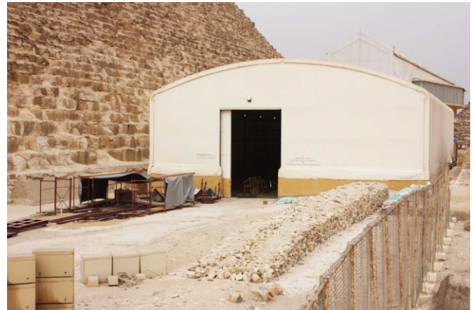
Figure 2: The large hangar, 20 m in width, 44 m in length, and a maximum 10 m in height