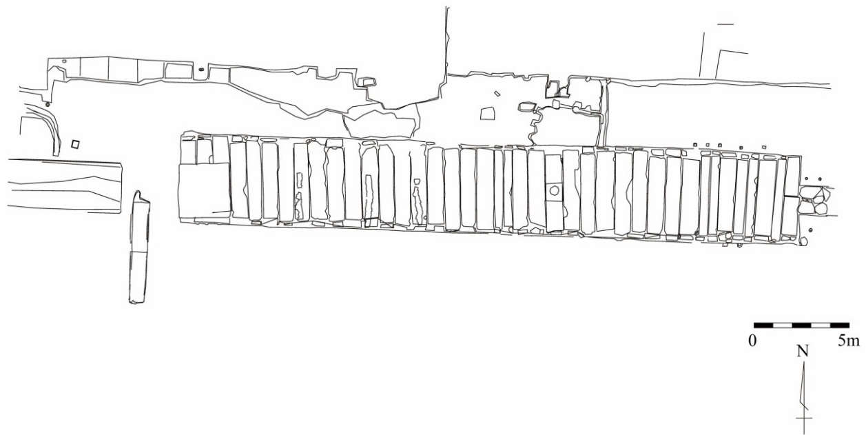
Figure 4: Diagram of the pit before removal of the cover stones