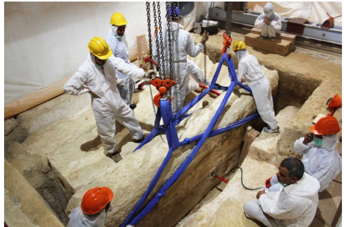
Figure 5: Lifting a cover stone