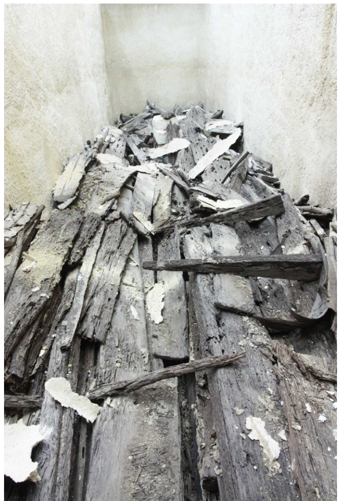
Figure 6: A view of the timbers inside the pit, February 2012