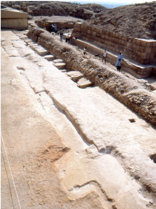
Figure 1: The state of the second boat pit (in 1992)

For the conservation work and storing the timbers, a laboratory and storage room are now under construction within the large hangar.