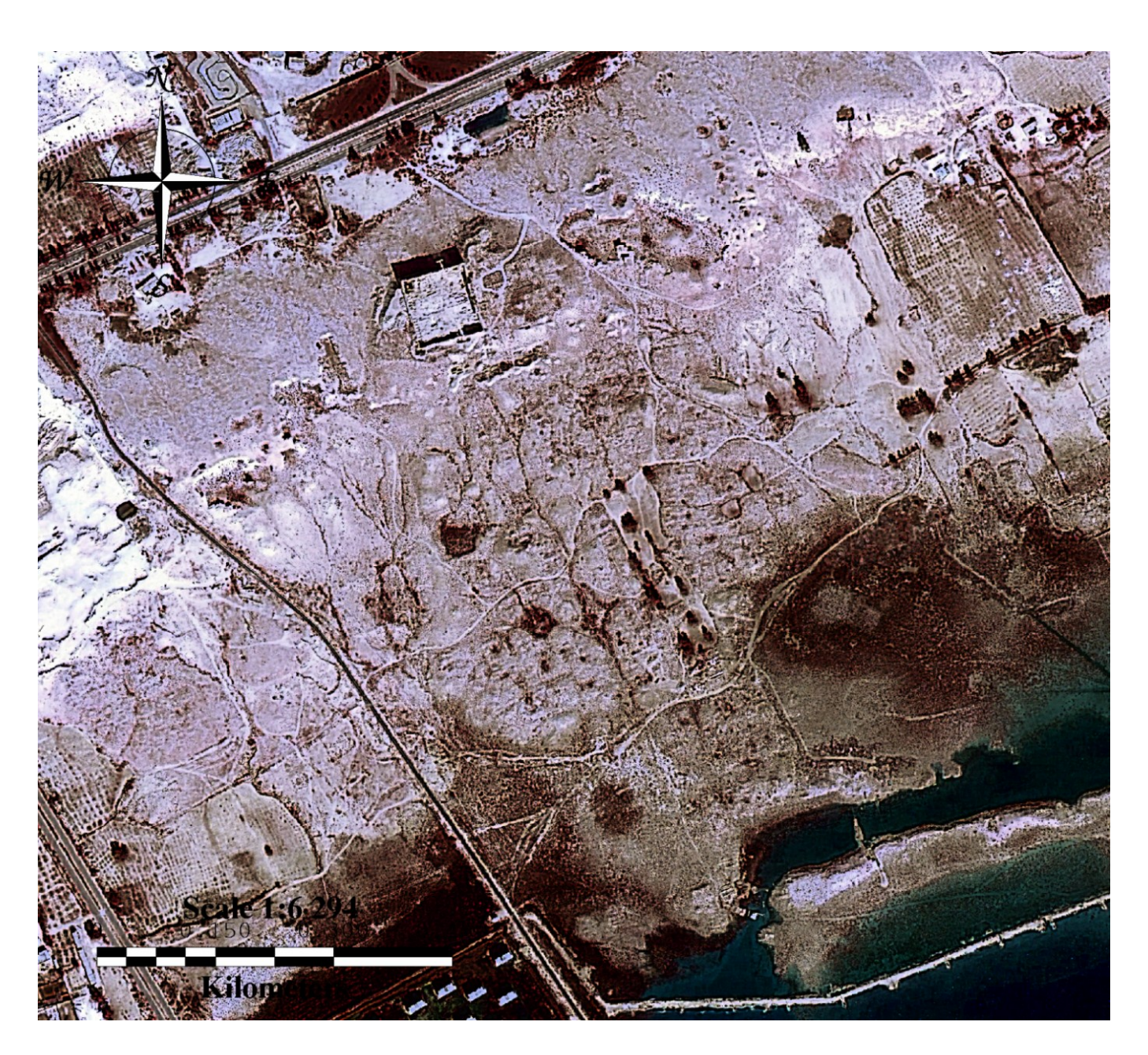
Figure 2: 432-RGB on a Quickbird pan-sharpened image with 11x11 high pass filter (S. Parcak)

and 2 (green) formed a 432 RGB image. An assessment of vegetation health using a Normalized Difference Vegetation Index (NDVI) found healthier shrubs growing atop several possible structures; using 11 x 11 high pass filters and Gaussian Equalization on the 432 RGB also distinguished additional features. By comparing the NDVI, the filtered imagery, and the visual 432 RGB, Parcak and Mumford found that subsurface architectural features appeared more or less strongly depending on the specific processing techniques used (figure 2).