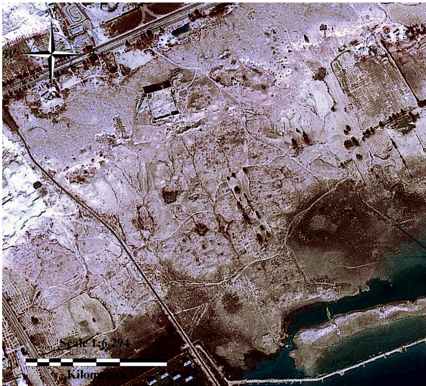
Figure 2: 432-RGB on a Quickbird pan-sharpened image with 11x11 high pass filter

and 2 (green) formed a 432 RGB image. An assessment of vegetation health using a Normalized Difference Vegetation Index (NDVI) found healthier shrubs growing atop several possible structures; using 11 x 11 high pass filters and Gaussian Equalization on the 432 RGB also distinguished additional features. By comparing the NDVI, the filtered imagery, and the visual 432 RGB, Parcak and Mumford found that subsurface architectural features appeared more or less strongly depending on the specific processing techniques used (figure 2).