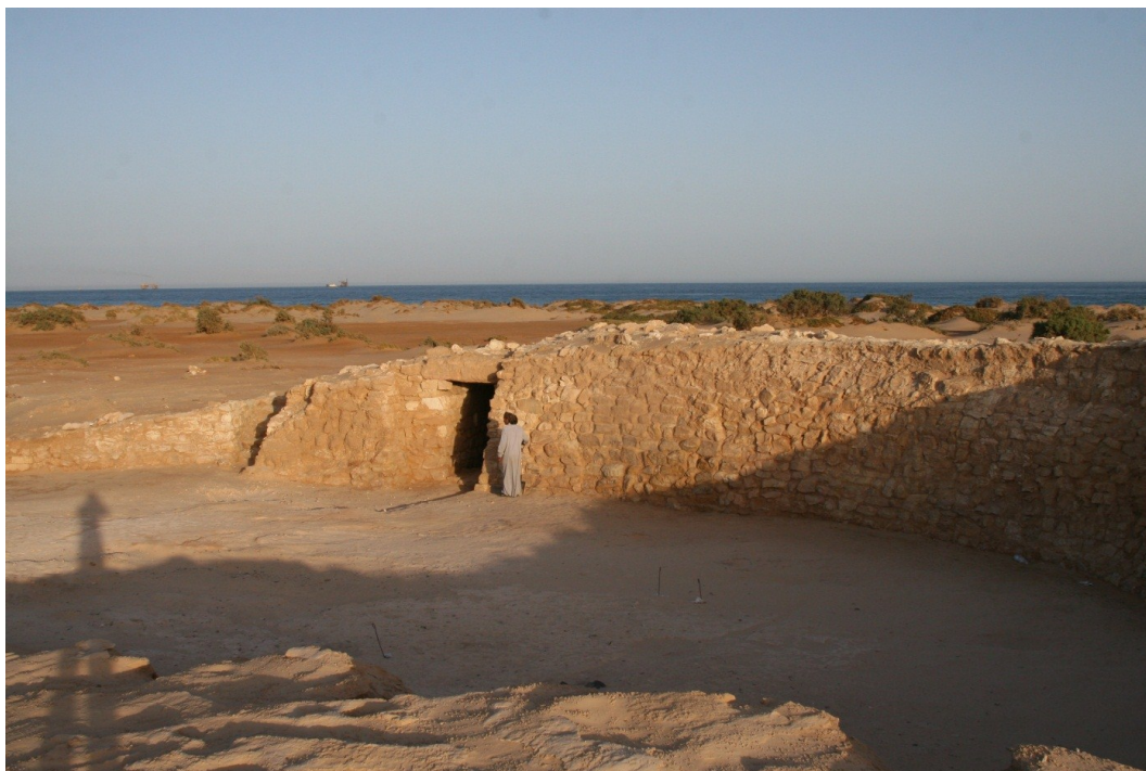
Figure 11: West side of courtyard with entry passage and stairway to battlements