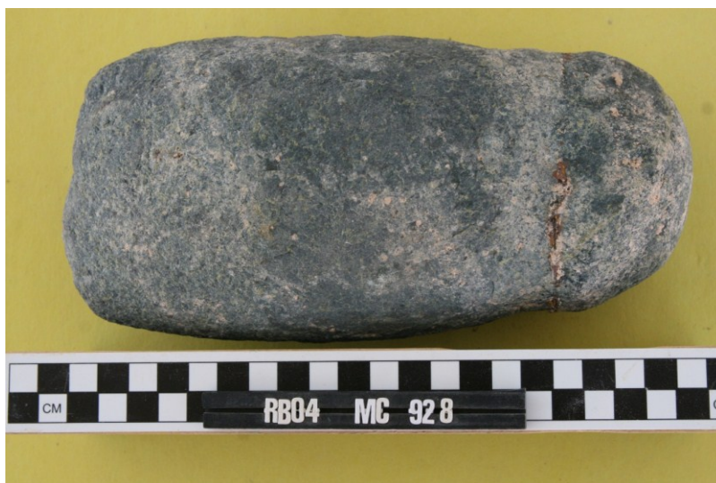
Figure 6: Hammer stone associated with stone debris from dismantling fort wall