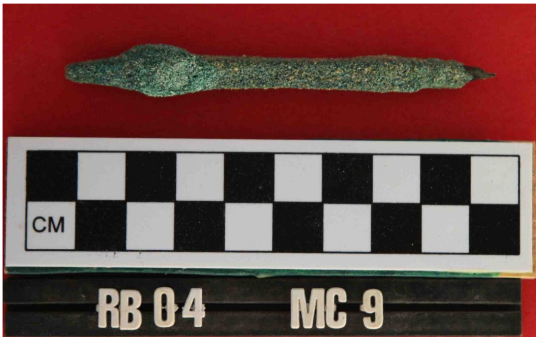
Figure 9: Late Old Kingdom copper alloy mortise chisel fragment MC no. 9