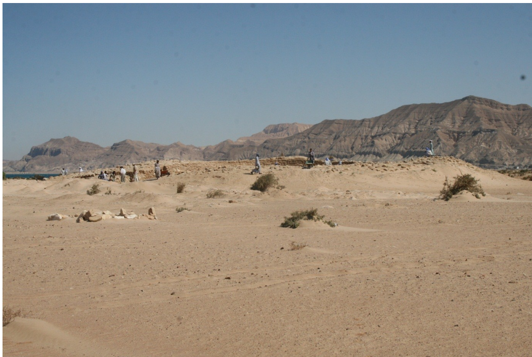
Figure 10: Looking north at fort, Red Sea, and mountains bounding Markha Plain