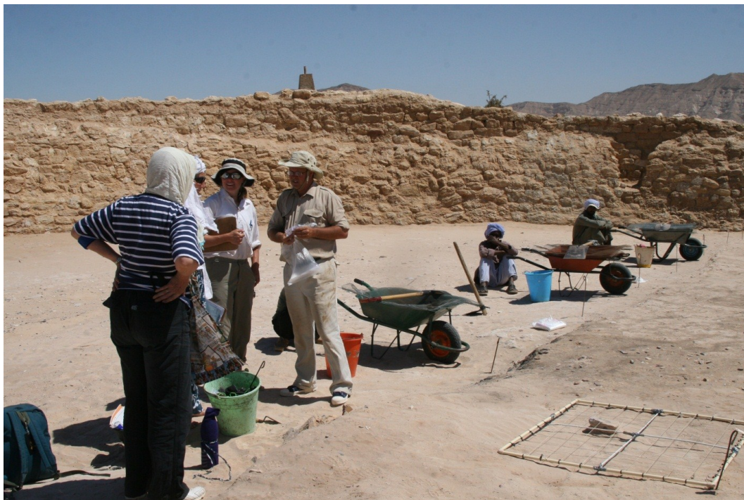
Figure 3: Sieving 1 x 1 m grid squares across the fort's upper occupation layer