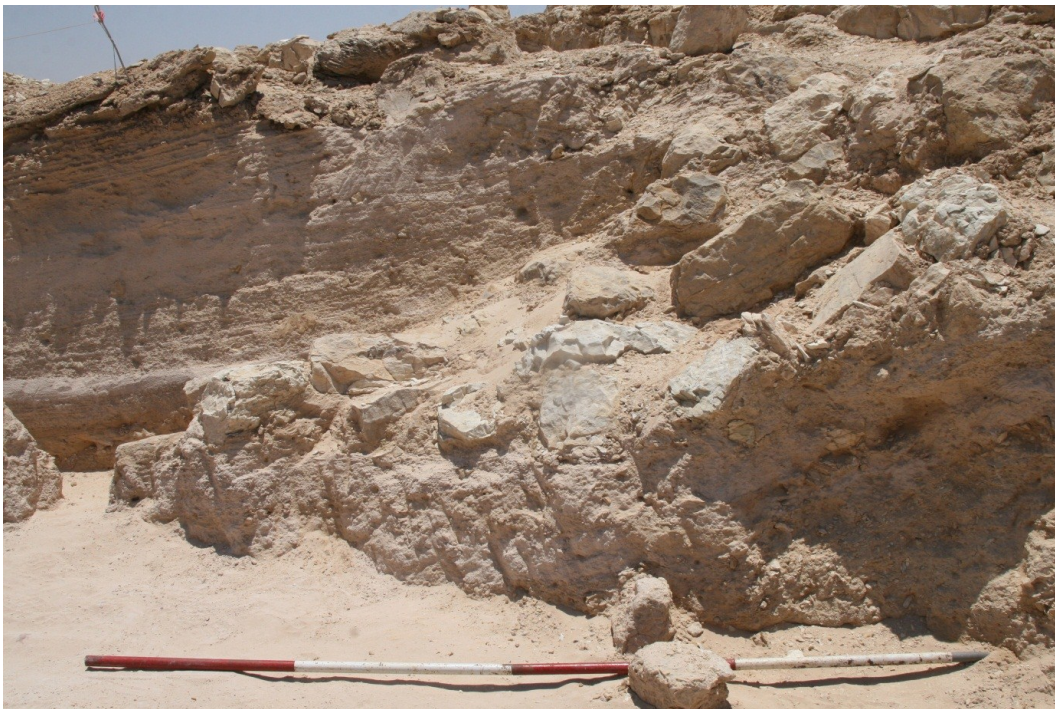
Figure 5: Blocks dislodged from wall in SE Quadrant Unit 6, Trench V/VI section