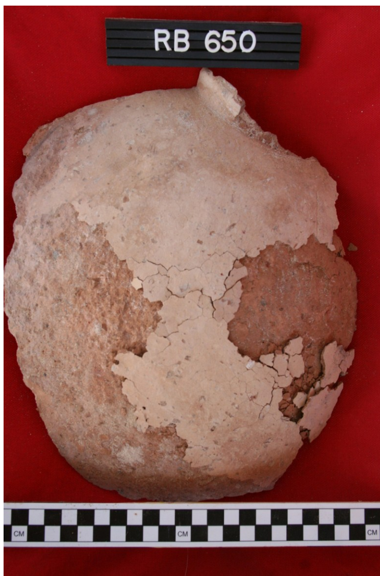
Figure 7: Late Old Kingdom storage jar fragment RB no. 650