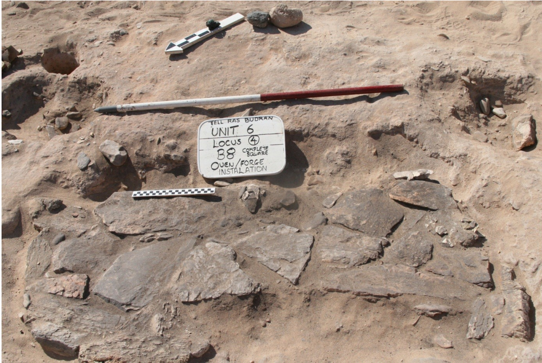
Figure 4: Stone paved baking installation in SE Quadrant (Unit 6), B8, locus 6