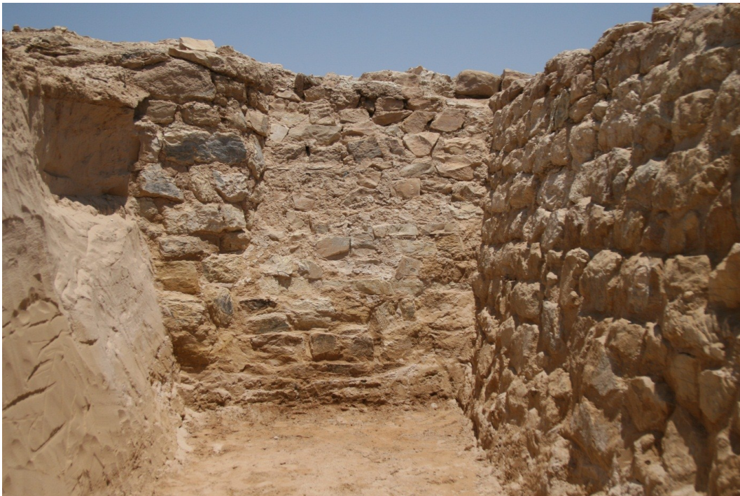
Figure 13: Exterior of blocked-up original entry passageway to the circular fort