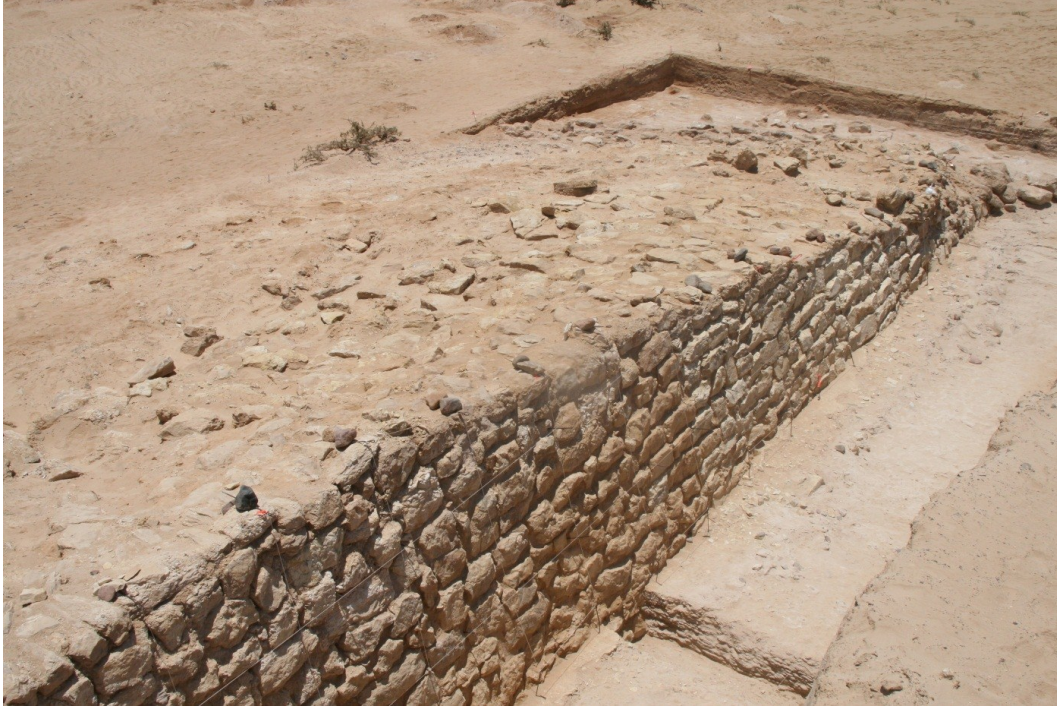
Figure 12: 2008 excavation of the fort's western "buttress" (or quay)