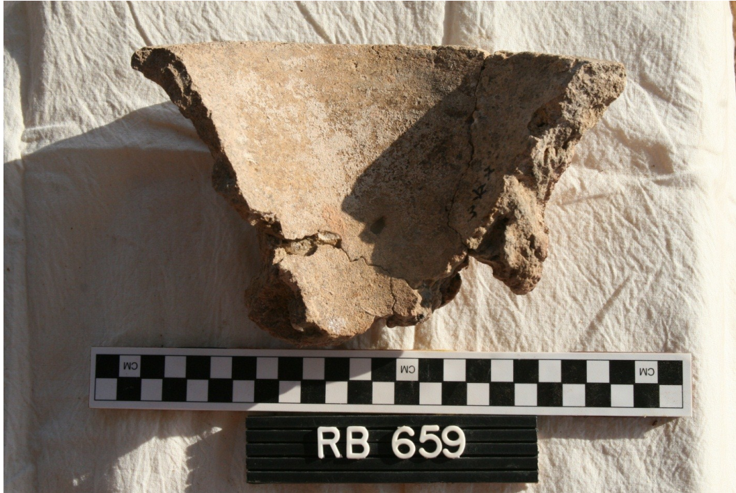
Figure 8: Late Old Kingdom bread mould fragment RB no. 659