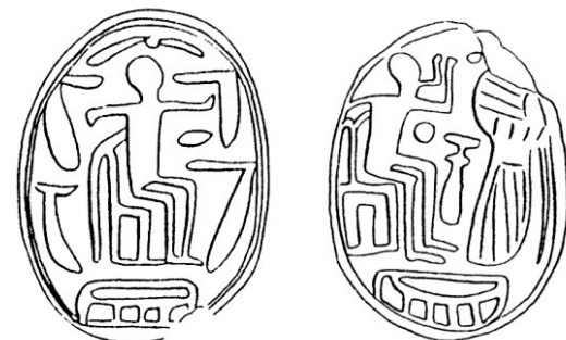
Figures 6 (Tell el-Ajjul) and 7 (Achzib) (Schipper, Vermächtnis, 274, No. 5 and 6)

Obviously, this iconography was adopted by the local scarabs, but the style and the design are quite un-Egyptian. The scarabs still show a sitting person, but without the symbols of a pharaoh. And we have also some hieroglyphic signs, like for instance the nbw -sign for gold, or the big one on the right side which is interpreted by Flinders Petrie as the nfr -sign, by Raphael Giveon as the dd -pillar and by Othmar Keel as the wꜥ3 -sign (for the papyrus column). 50 What can be seen here too is a change of objects. For example, the uraeus of the original Egyptian scarab, where it is a part of the head, is now something protruding from the mouth of the enthroned. Objects of this group of scarabs were found in layers of the 11 th to the 9 th century (late Iron I up to Iron IIB). This documents on the one hand the constancy of