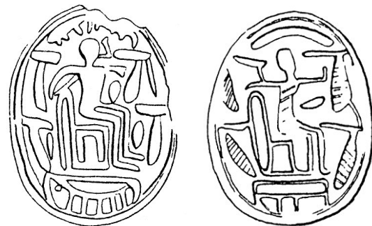
Figures 4 (Tel Zeror) and 5 (Gezer) (Schipper, Vermächtnis, 274, No. 4 and 8)

has drawn attention to a group of scarabs, which he calls the group of the “Eckig-stilisiert-Thronender” (that translates something like “the angled-styled-enthroned”). 49 This Early Iron Age group is characterized by an iconography which on the one hand rests in an Egyptian tradition but on the other hand breaks with it. The scarabs of the group picked up one main motif of Egyptian iconography: the sitting pharaoh, as we find it on scarabs of the New Kingdom and also from the Third Intermediate Period: