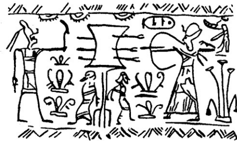
Figure 1: Cylinder Seal of Ramesses II (Schipper, Vermächtnis, 274, No. 2)

stands out. The stelae from the Egyptian Pharaohs were used in later times. The excavations of the University of Pennsylvania (1921-1933) showed that the old garrison was renovated under Ramesses III. This garrison also includes an Egyptian temple, which displays a combination of genuine Egyptian objects and local culture. 33 Additionally we have a number of Egyptian artefacts and pieces like scarabs or amulets from a depot of this temple. And, following the aforementioned line, the material documents a combination of ‘Canaanite’, i.e. ‘Syrian’, and Egyptian motifs. 34