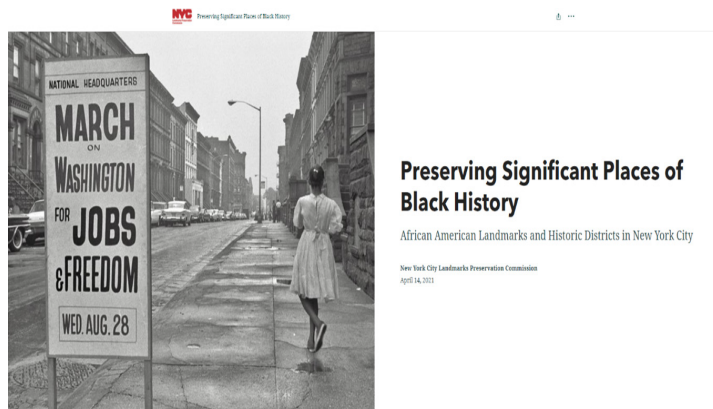
Figure 2: Preserving Significant Places of Black History

Listed below is a project completed using ArcGIS StoryMap.