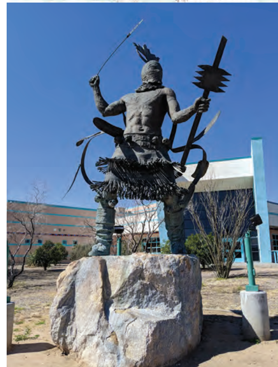
Top: Maximus' drawing that is featured on the cover of the magazine